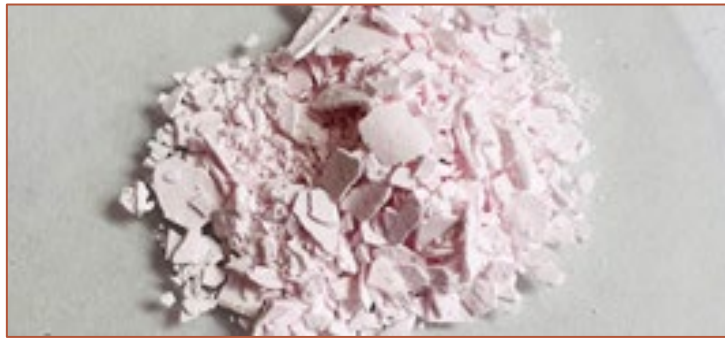
Figure 5: Jupiter's >99.9% pure sample of High Purity Manganese Sulphate

Jupiter successfully produced a >99.9% pure sample of HPMSM, or battery grade manganese, with existing Tshipi manganese ore and utilising an internally developed hydrometallurgical production process.