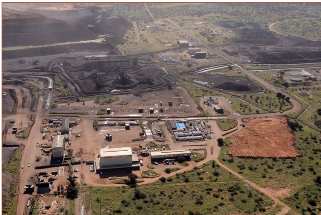
Figure 2: Tshipi Manganese Mine

Mining volumes improved compared to the prior comparative period. Tshipi commenced drilling interventions with labour availability improving also. Production volumes increased significantly during the period, with Tshipi achieving production records. Low grade production recommenced to meet requested mine gate sales as well as to take advantage of increased rail availability. Healthy stockpiles remained at the end of December 2023.