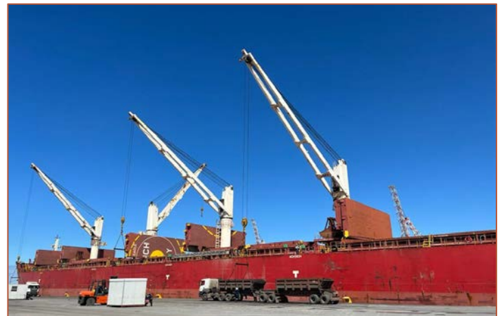
Figures 3 and 4: Port of Lüderitz and Port Elizabeth