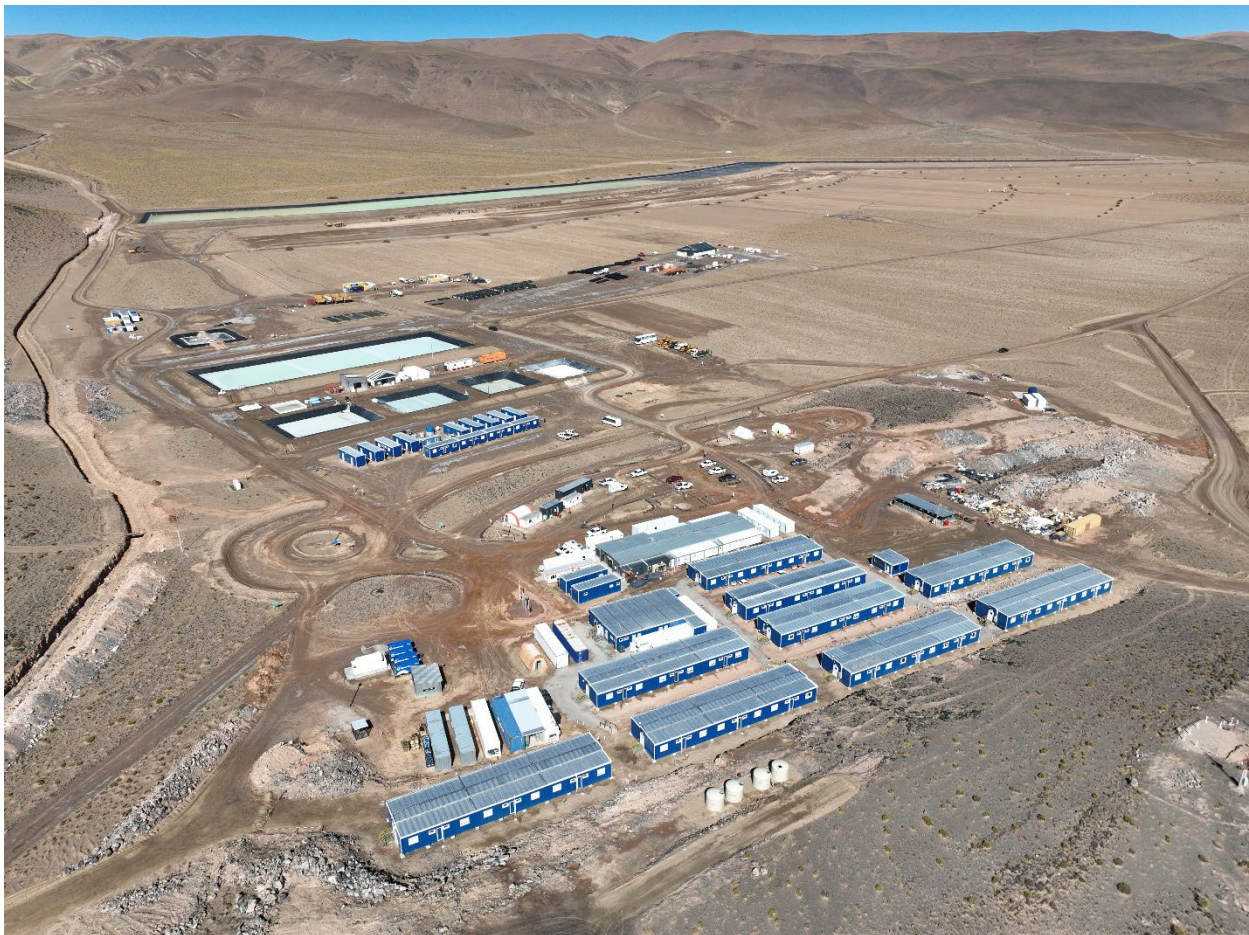
Construction progress at HMW (February 2024)

"The completion of earthworks and the installation of liners for Pond 1 represents a significant milestone for the HMW Phase 1 construction team. Evaporation has now commenced which is the first step of the Company's long-term production schedule for its low-cost, low-risk lithium chloride development strategy, as Galan looks to become the next lithium producer in Argentina in H1 2025."