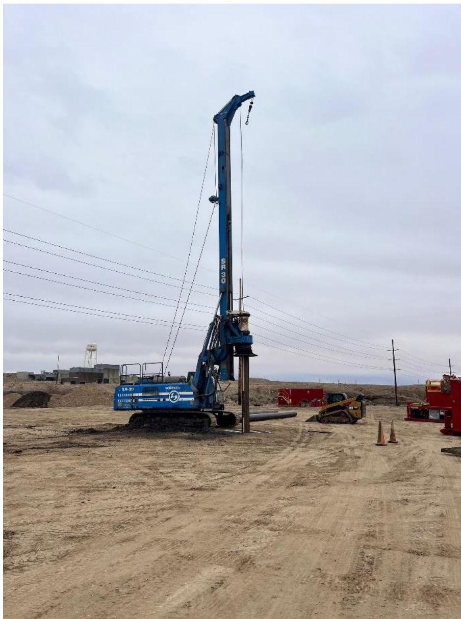
Figure 1: The drill rig setup at the Bositydaba#1 well site.