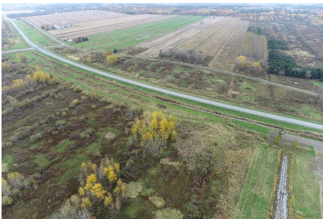
Figure 3: South side of Lot 22 at Bécancour, Québec proximal to highway access.