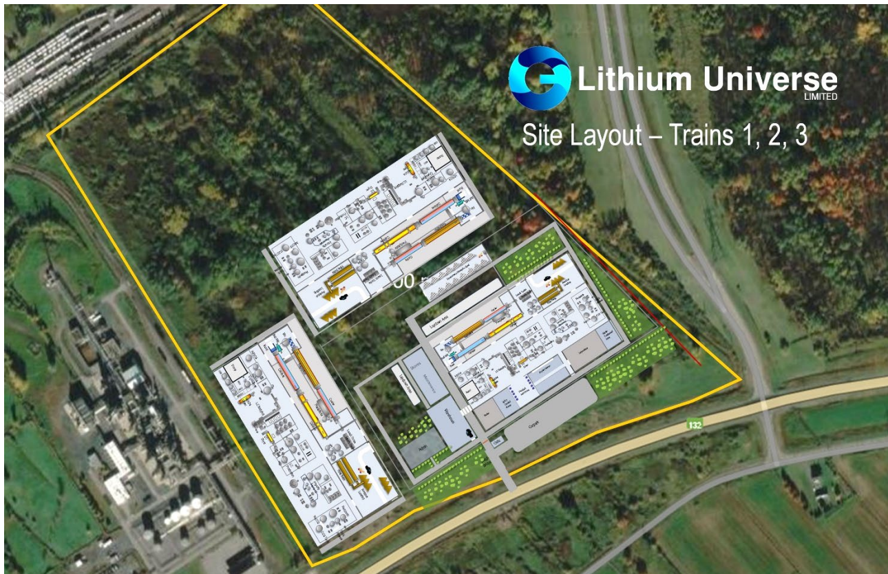
Figure 5: Potential expansion of additional trains at Lot 22 at Bécancour, Québec.