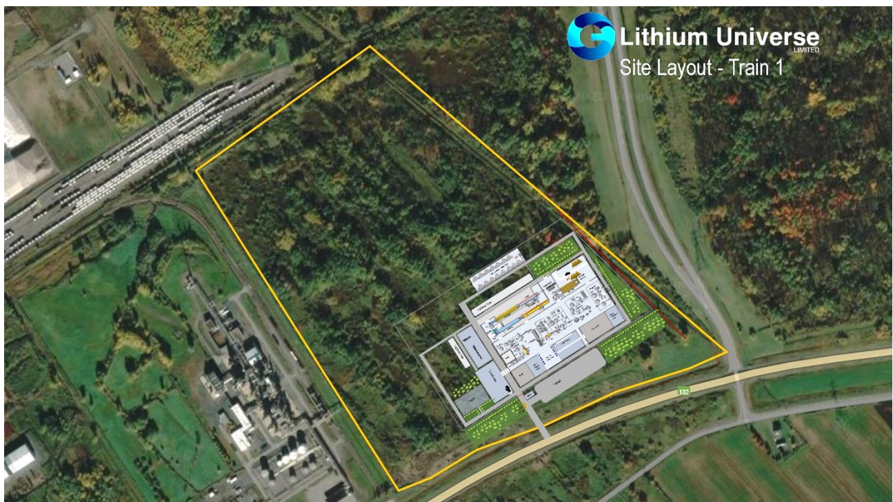
Figure 2: The Company's site layout superimposed on Lot 22 at Bécancour, Québec.

The intended use of the Site will be to host the Company's proposed lithium carbonate refinery. As previously outlined under the Company's QLPH strategy, a lithium carbonate refinery, rather than lithium hydroxide refinery, has been selected due to the widespread use of the concentrate in the fast-growing Lithium Iron Phosphate (LFP) batteries. LFP batteries are increasingly used in EV applications due to their lower costs, longer shelf life and superior stability compared with lithium hydroxide. In addition, having regard to the Lithium Universe Board and management expertise in lithium carbonate processing, the Site is considered to have the necessary attributes to be a success of the Company's proposed facilities. Figure 2 shows the layout of the first 16,000 tpa lithium carbonate refinery. The site is large enough to cater for future expansions, with a further two trains of 16,000 tpa being able to fit on the site, See Figure 5.