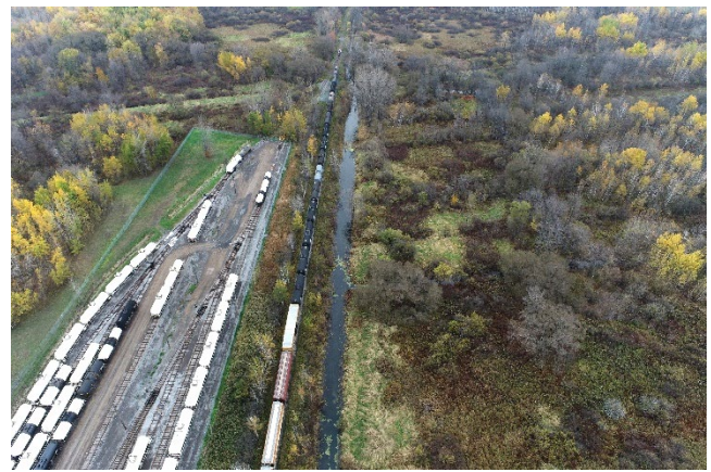
Figure 4: North side of Lot 22 at Bécancour, Québec proximal to rail infrastructure.