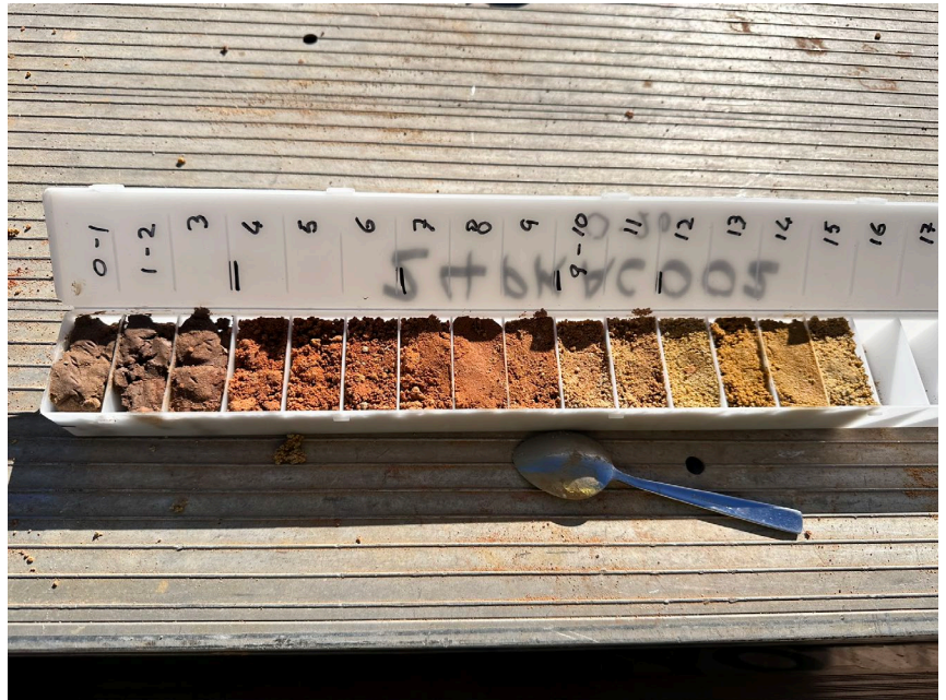
Figure 3: Parrakie aircore drilling Loxton/Parilla Sands (left) and clay/clayey sands intersected in the drilling