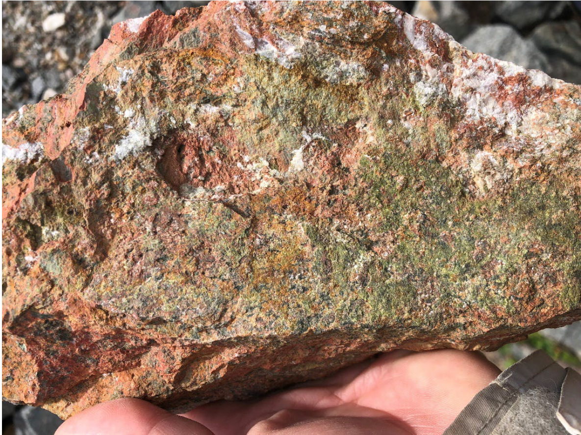
Figure 3: Epidote quartz veined and red rock altered granite sample from Yundamindra shaft waste dumps.