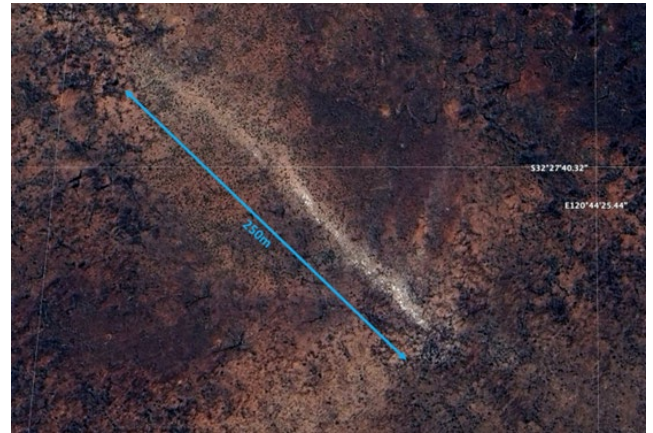
Figure 2 Satellite image anomaly – potential outcropping pegmatite.

Satellite image interpretation has identified a potential target at the Lisa Prospect at Lake Johnson. The satellite image clearly shows a light-coloured outcrop with a strike length of approximately 250m. The anomaly is interpreted as a potential pegmatite target, however it will require on-ground follow-up investigations to determine the geological nature of the anomaly.