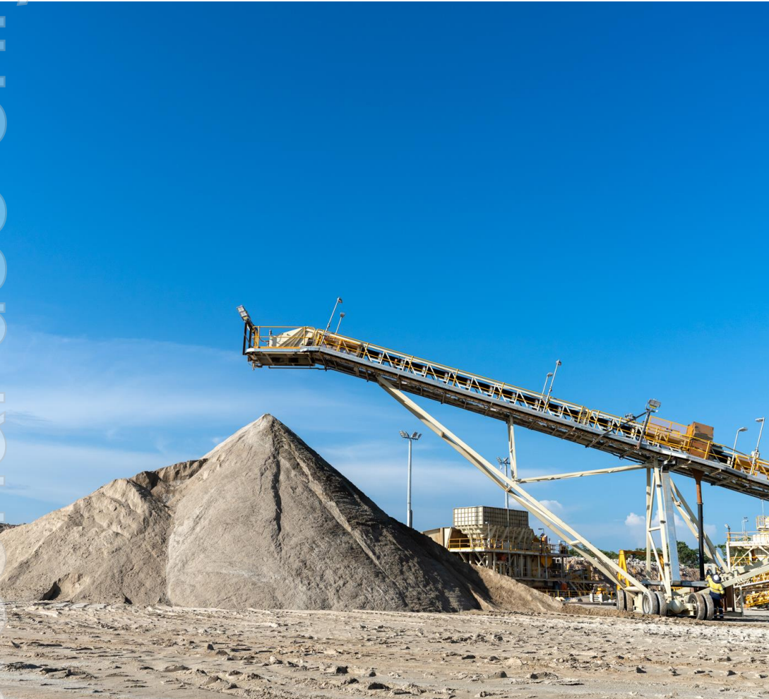
Spodumene concentrate production

Recoveries: 56% October, 60% November and 63% December