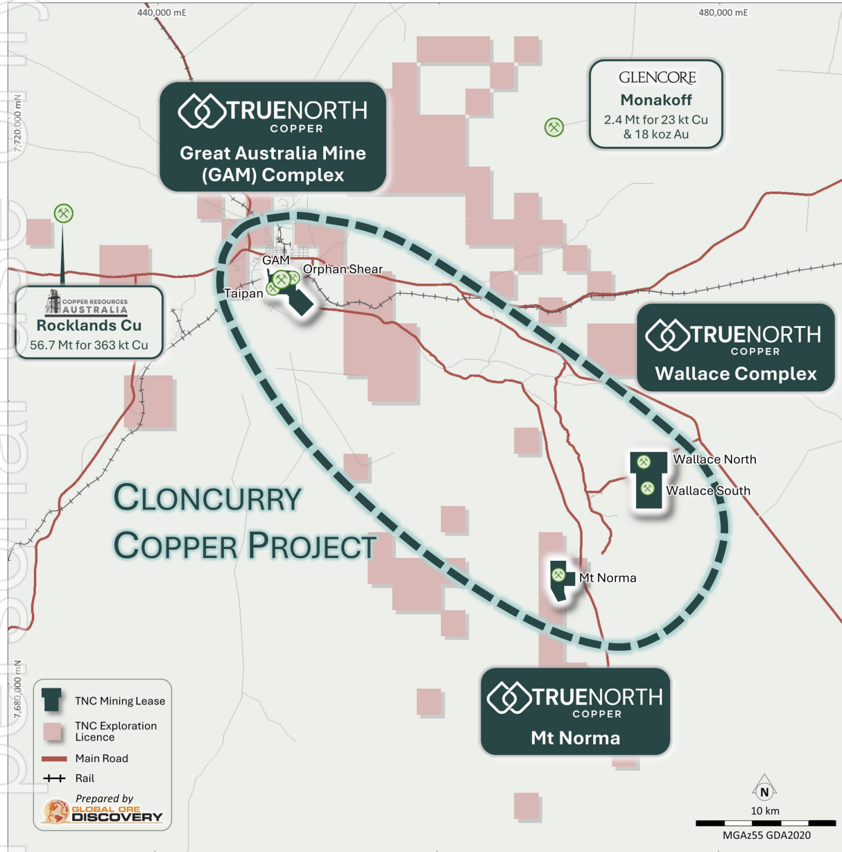
Figure 1. TNC's Cloncurry Copper Project.