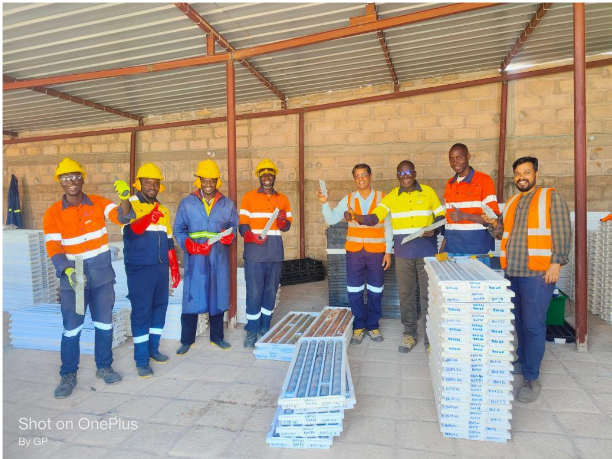
Figure 2: Blakala drilling team happy with continued mineralised strike