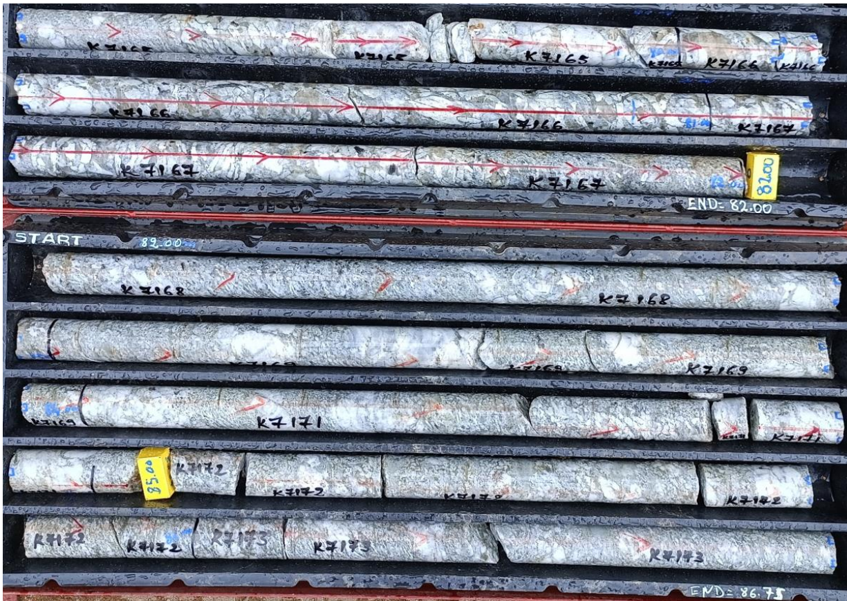
Figure 3: Assay sample BDFS03 80 to 89m average 1.92% \text{Li}_2\text{O}