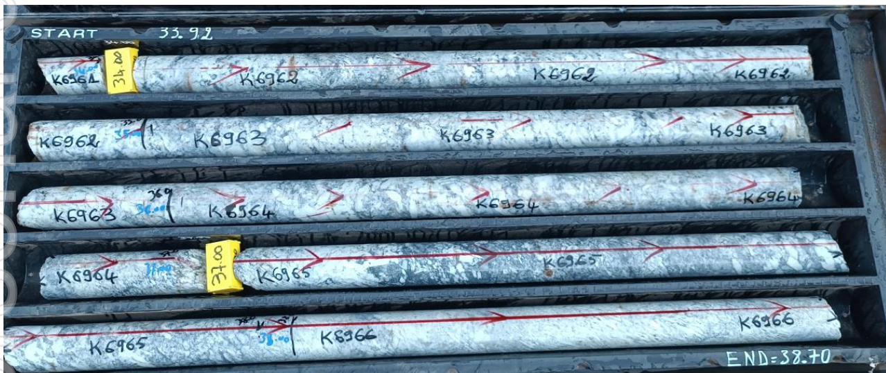
Figure 2: Assay sample BDFS02 33m to 41m average 3.73% Li 2 O