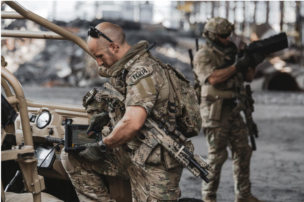
Image: DroneSentry-C2 Tactical deployment solution

The C2T provides an intuitive satellite map-based display, with a 2-way communication between the user and the distributed network of counterdrone devices, demonstrating drone detections from a network of sensors back to a central point anywhere to a rugged user tablet, as well as ability (where lawful) to activate drone defeat systems.