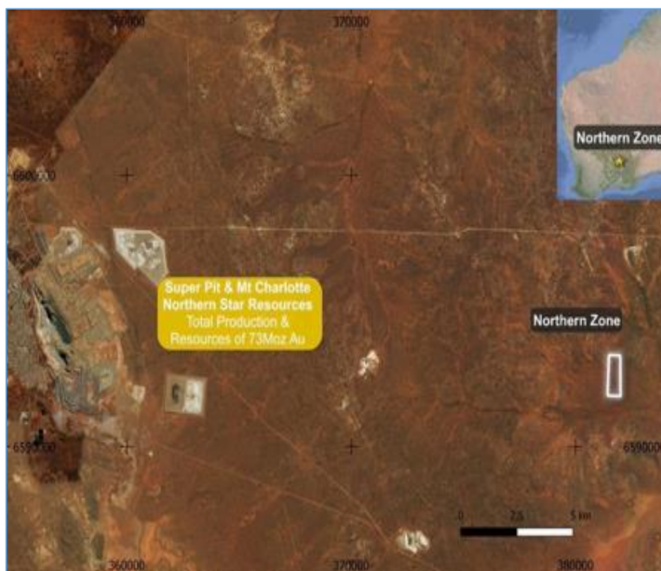
Figure 1: Northern Zone Project Map showing proximity to the Kalgoorlie "Super Pit".

David Lenigas, Chairman of RGL, said: “With the Australian dollar gold price now pushing through $3,100 an ounce, the commerciality of these types of large-scale lower grade gold deposits becomes significantly more viable. The potential scale of this project linked to its good indicative conventional gold recoveries and its great location, being so close to Kalgoorlie, makes Northern Zone a highly attractive project to drill out. The 4 diamond drill holes on this cross section absolutely confirmed the gold prospectivity of the Northern Zone Project and we look forward to drilling further along strike to start building a maiden JORC compliant resource early in the new year.”