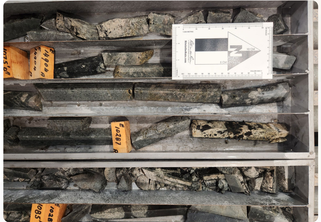
Above: Core samples retrieved from historical drilling at Gibraltar Rock for further analysis by the GDM geological team