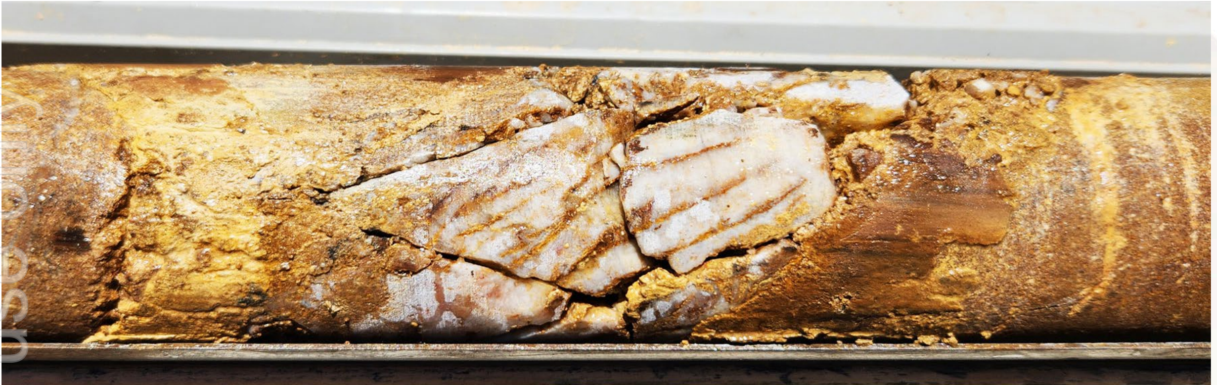
Yellow Jack – Drilling commenced within weeks of IPO

Core sample from diamond drill hole 23YJDD217 between 17.70 and 17.89 m showing iron-rich quartz veining.