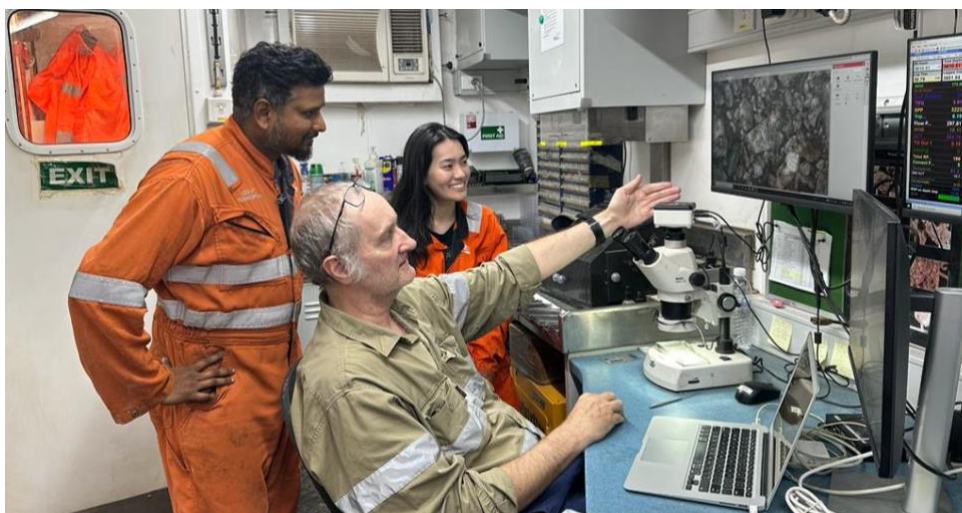
Engineers & geologists in Daydream-2's Mudlogging Unit

The well will now drill the remaining reservoir section to a Total Depth (TD) of approximately 4,200 metres, then wireline logs will be run and a petrophysical evaluation undertaken. The well will be then cased and suspended for future stimulation and testing operations, planned for the New Year.