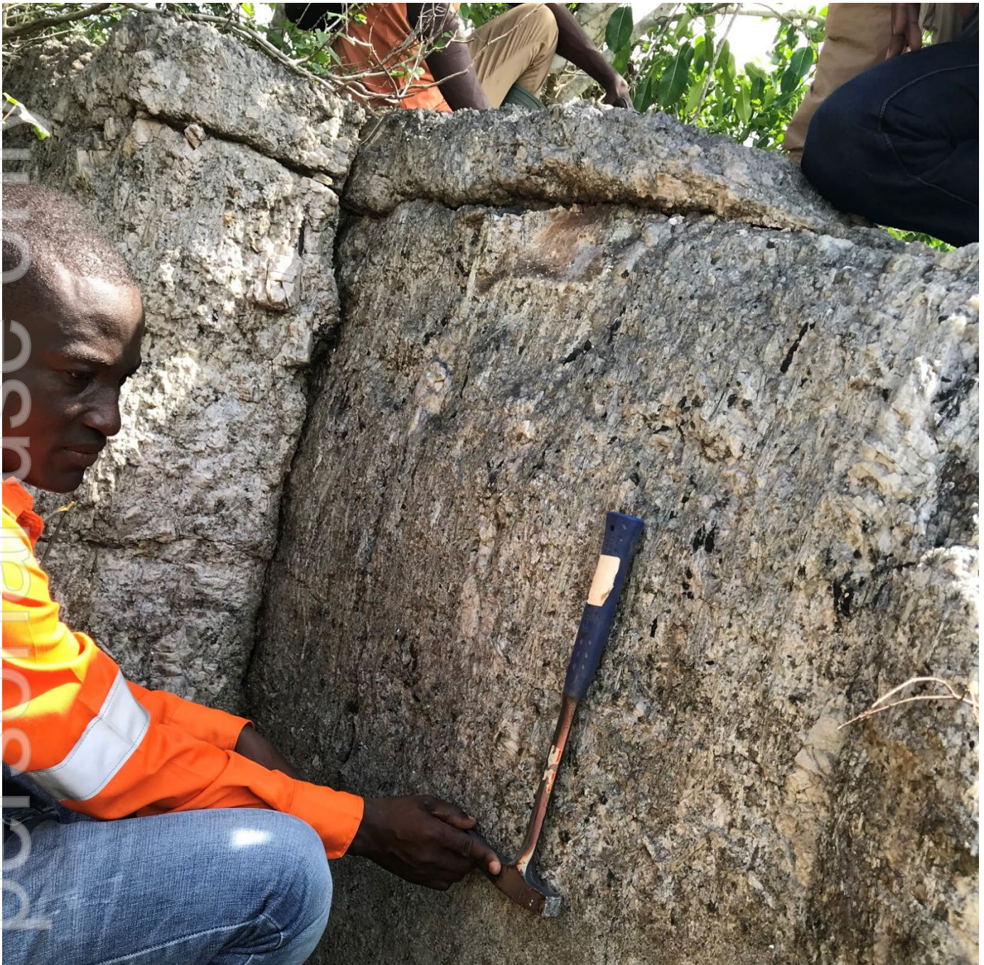
Figure 4: Spodumene-rich pegmatite outcrop on Egyasimanku Hill with spodumene crystals (green) evident parallel to the direction of hammer handle throughout the outcrop.

NOTE: Visual estimates of mineral abundance should never be considered a proxy or substitute for laboratory analyses where concentrations or grades are the factor of principal economic interest. Visual estimates also potentially provide no information regarding impurities or deleterious physical properties relevant to valuations.