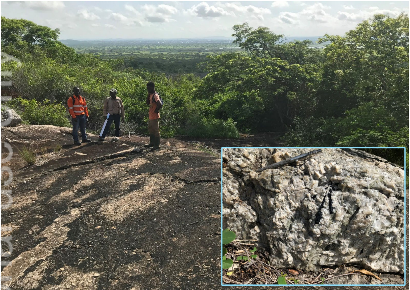
Figure 3: View standing on the Egyasimanku Hill spodumene pegmatite mineral occurrence looking north-east towards the Bewadze licence and flat planes in the distance; insert close-up of spodumene pegmatite outcrop at Egyasimanku Hill.

NOTE: Visual estimates of mineral abundance should never be considered a proxy or substitute for laboratory analyses where concentrations or grades are the factor of principal economic interest. Visual estimates also potentially provide no information regarding impurities or deleterious physical properties relevant to valuations.