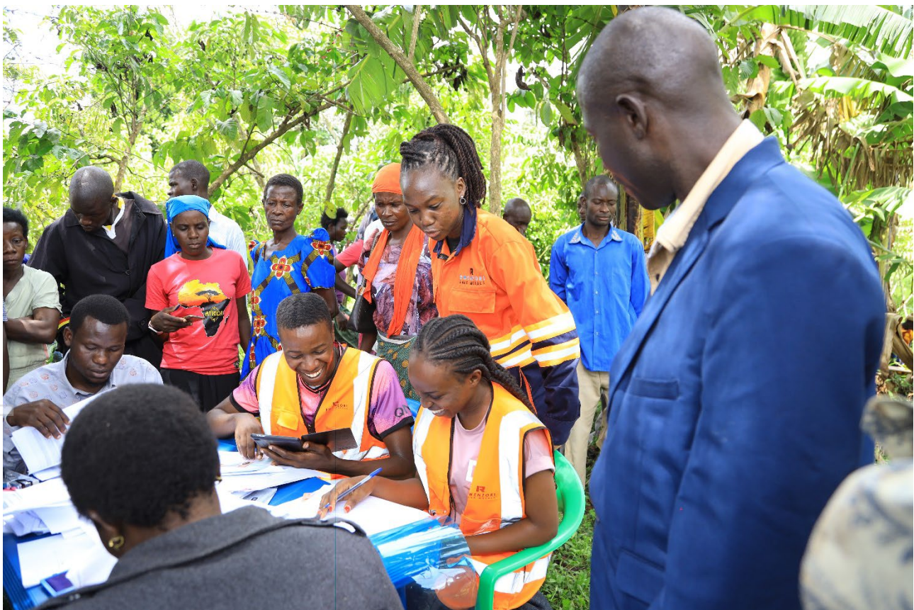
Figure 2: Land access agreements being signed at Bugweri District, Makuutu Rare Earth Project.