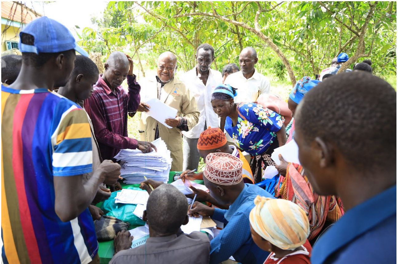
Figure 3: Land access agreements at Bugweri district, Makuutu Rare Earths Project.