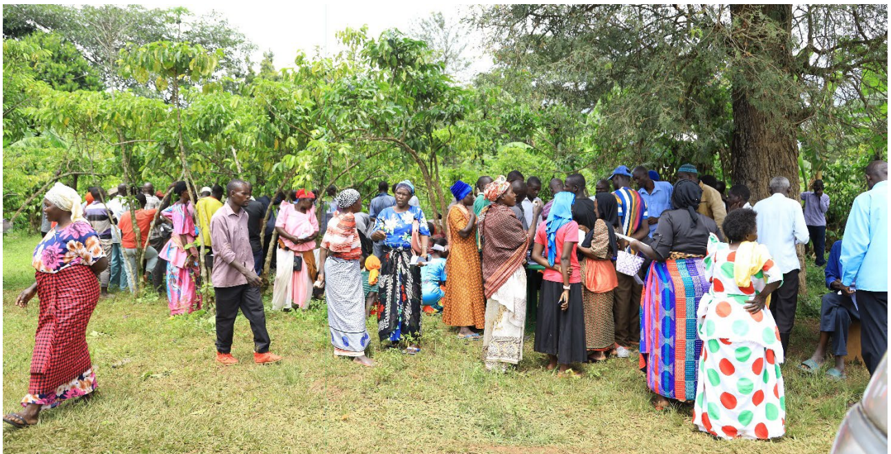
Figure 4: Land access agreements at Bugweri district, Makuutu Rare Earths Project.