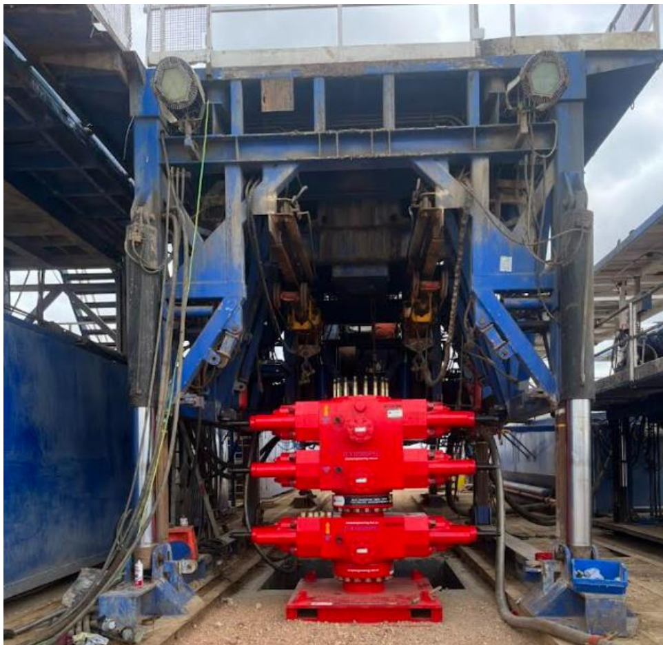
BOP and Sub-base of SLR 185 Rig

SLB's (previously called Schlumberger) SLR 185 rig and a new 10,000 psi blow-out preventer (BOP) were duly accepted/certified prior to the spud.