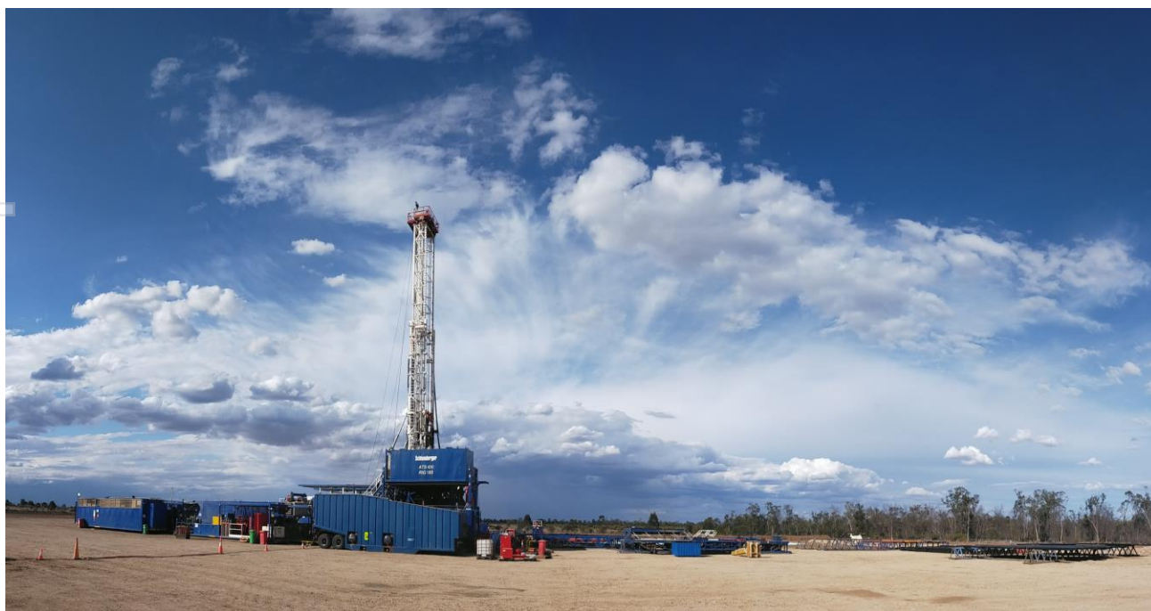
SLR 185 Rig

Elixir Energy Limited (“Elixir” or the “Company”) is pleased to provide an update on the its 100% owned Grandis Gas Project (ATP 2044) located in the Taroom Trough of the Bowen Basin, Queensland.