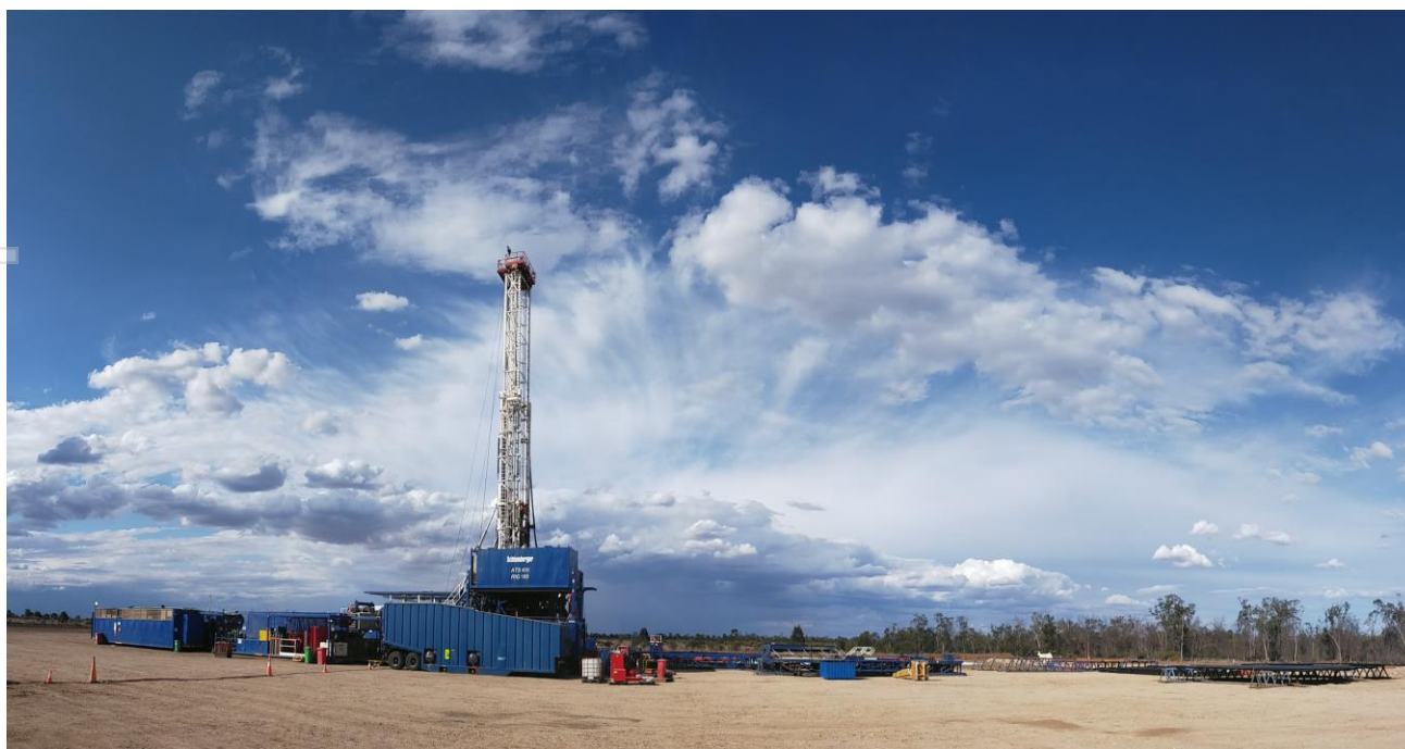
SLR 185 Rig

Elixir Energy Limited (“Elixir” or the “Company”) is pleased to provide an update on the its 100% owned Grandis Gas Project (ATP 2044) located in the Taroom Trough of the Bowen Basin, Queensland.