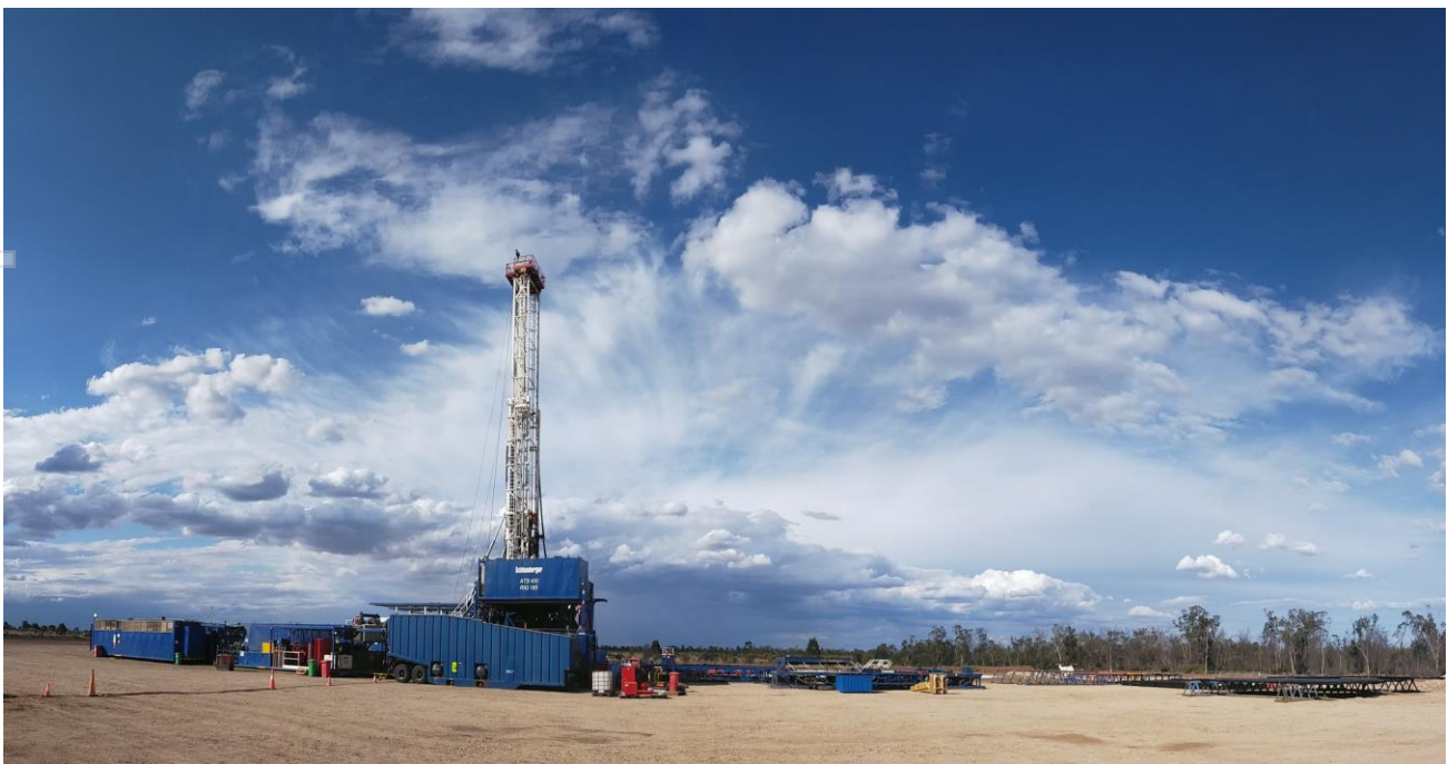
SLR 185 Rig

Elixir Energy Limited (“Elixir” or the “Company”) is pleased to provide an update on the its 100% owned Grandis Gas Project (ATP 2044) located in the Taroom Trough of the Bowen Basin, Queensland.