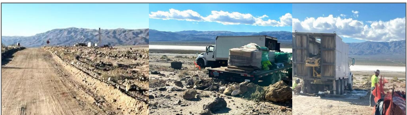
Figure 1: Drill rig – Photos at the first drill hole at the Liberty Lithium Brine Project

QXR has broad optionality in its lithium portfolio, being favourably exposed to the US market and having a large footprint in the sought-after WA Pilbara region. We are committed to developing projects in both locations based on active exploration programs."