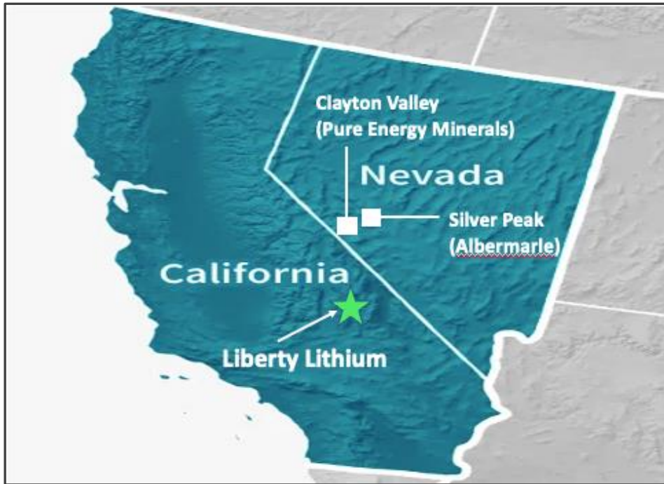
Figure 6: Location map of Liberty Lithium area (SaltFire Flat Project)

Authorised by the Board of QX Resources Limited.