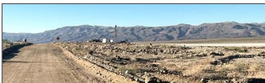
Figure 4: The first drill site - Salt Fire Flat at Liberty Lithium