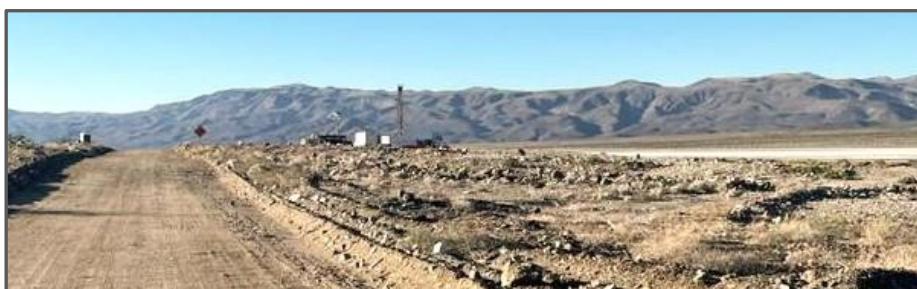
Figure 4: The first drill site - Salt Fire Flat at Liberty Lithium