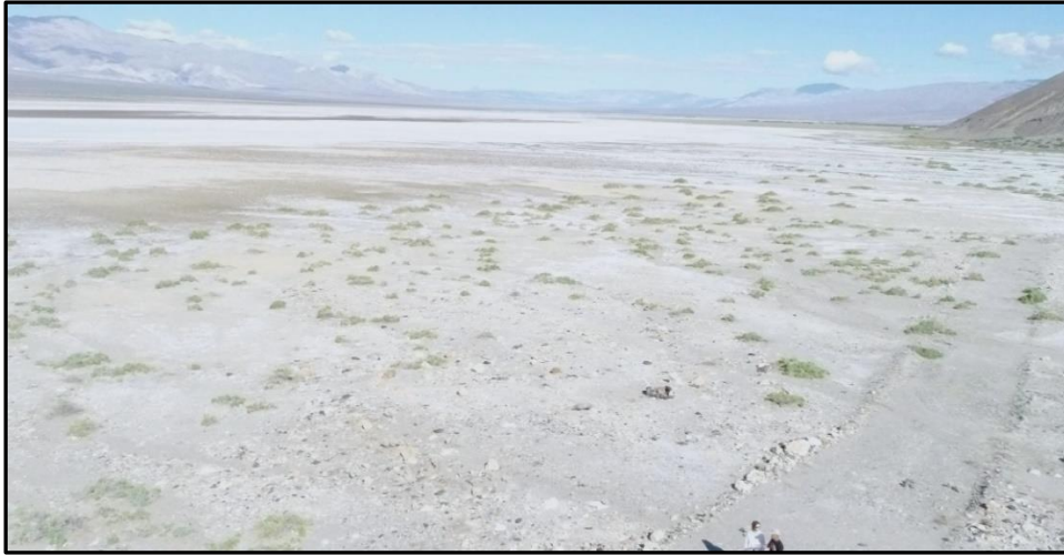
Figure 5: The first drill site prior to rig being onsite - Salt Fire Flat at Liberty Lithium