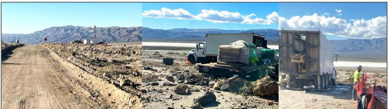
Figure 1: Drill rig – Photos at the first drill hole at the Liberty Lithium Brine Project

QXR has broad optionality in its lithium portfolio, being favourably exposed to the US market and having a large footprint in the sought-after WA Pilbara region. We are committed to developing projects in both locations based on active exploration programs."