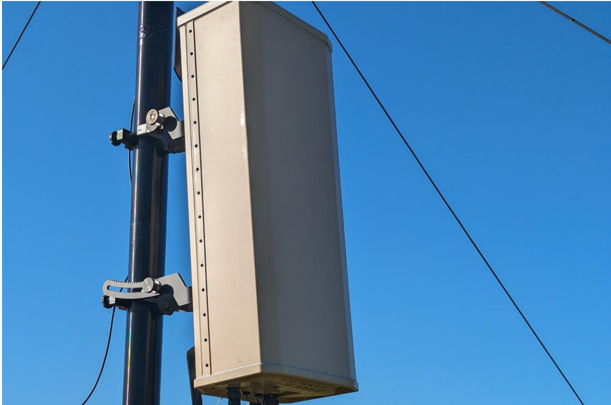
Image: DroneCannon Mk2, DroneShield's wide area non-kinetic effector

"The addition of proven C-UAS jammers, such as DroneCannon Mk2, is part of Agile Shield's planned transition from the virtual world to field demonstrations which occurred in October 2023."