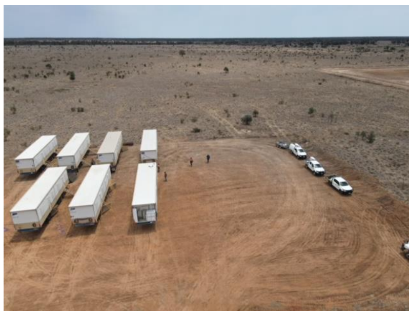
Equipment arriving at the Daydream-2 site

Elixir’s drilling contractor SLB (previously known as Schlumberger) has formally advised that the contracted rig SLR 185 has been released by its current operator. The drilling unit and camp are currently mobilizing to the Daydream-2 well site and following acceptance testing the well will be due to spud early next week.