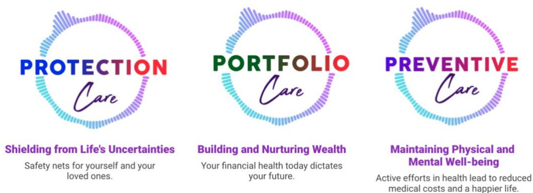
Figure 1. The 3P Framework: Protection Care, Portfolio Care, Preventive Care