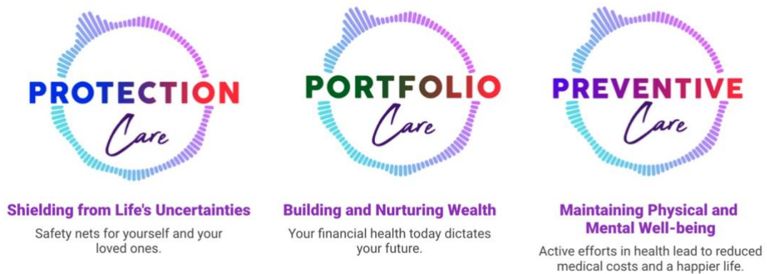
Figure 1. The 3P Framework: Protection Care, Portfolio Care, Preventive Care