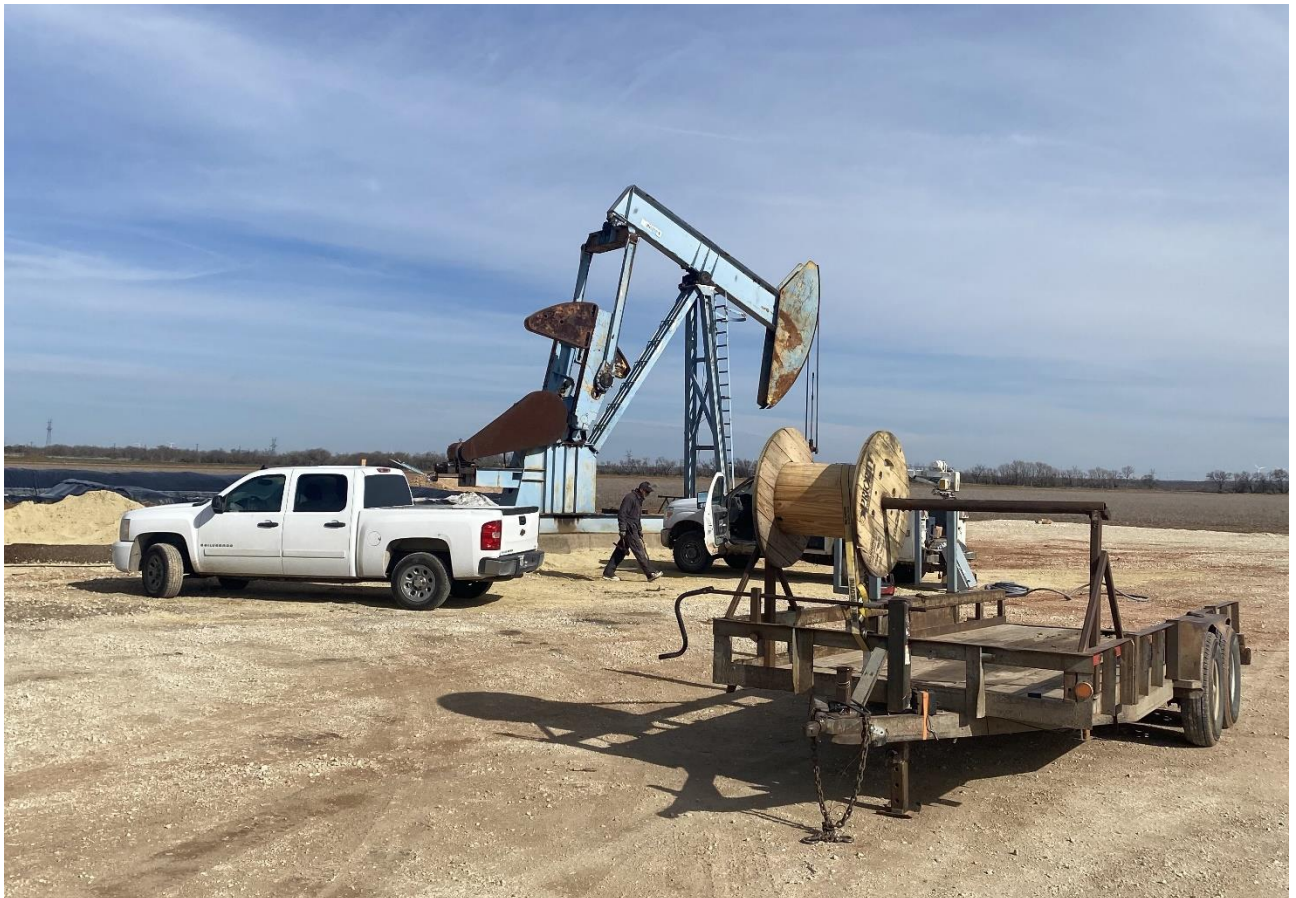
Figure 1: JVU #6 Pumping Unit