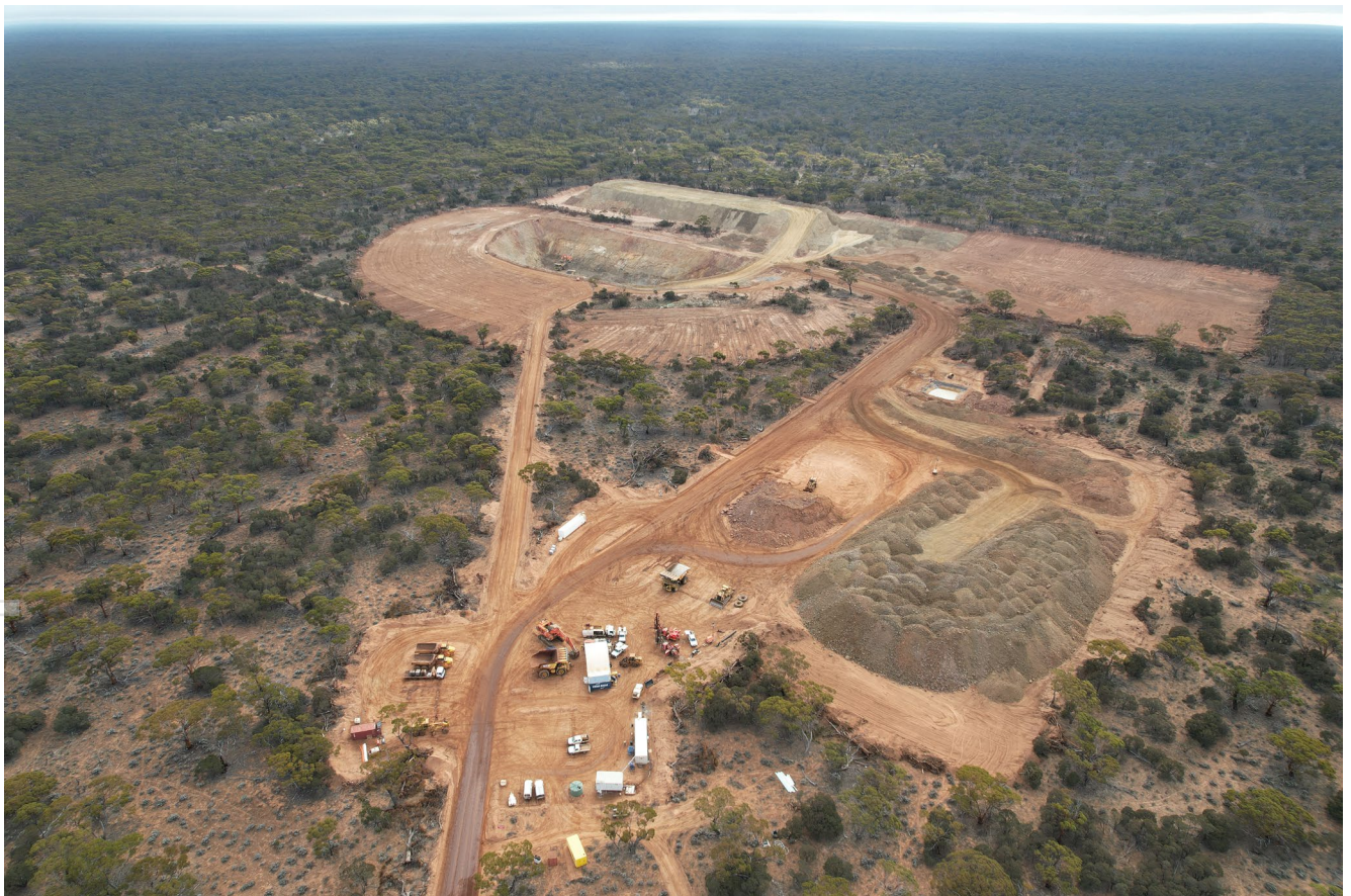
Figure 1. Jeffreys Find Mine Site at completion of the stage 1 pit – note Run of Mine ore stockpiles lower right.

The first stage of Mining at Jeffreys Find has been completed with over 180,000t of ore extracted. All of the ore has been hauled to the Greenfields Mill and the second and final processing campaign for the first stage is nearing completion.