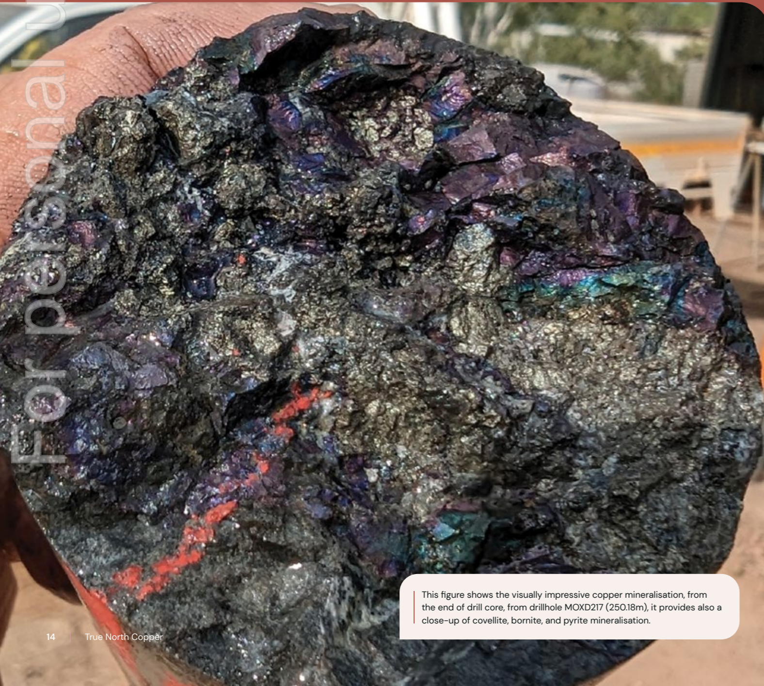
This figure shows the visually impressive copper mineralisation, from the end of drill core, from drillhole MOXD217 (250.18m), it provides also a close-up of covellite, bornite, and pyrite mineralisation.

TNC is rapidly advancing its knowledge of the Mt Oxide Project's phenomenally mineralised system and using this information to develop mining studies and find new discoveries.