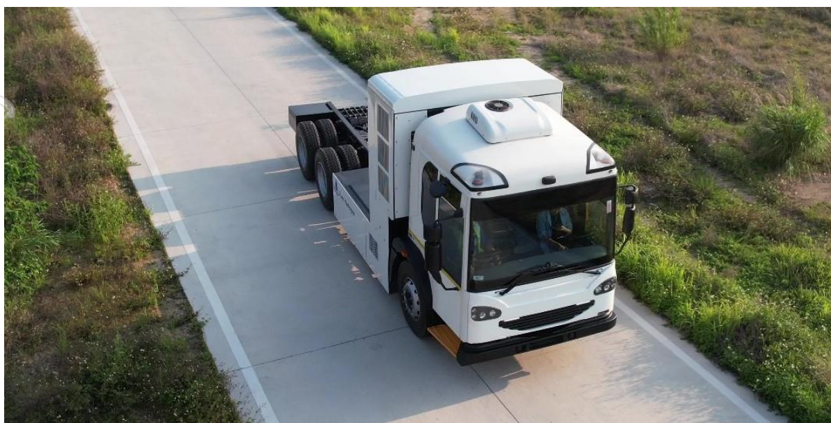
Image 2: Another view of Pure's first hydrogen fuel cell waste collection vehicle.