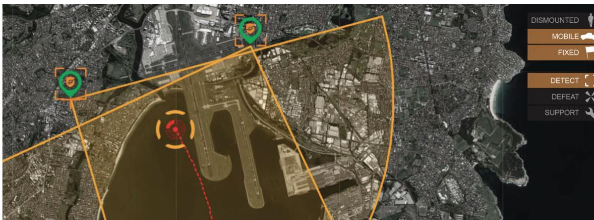
Image: target tracking with SFAI

While the dollar amount of expected sales cannot be quantified at this time, it is expected to be material, and the Company will provide further guidance when available.