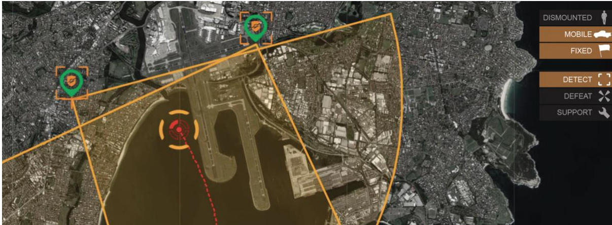
Image: target tracking with SFAI

While the dollar amount of expected sales cannot be quantified at this time, it is expected to be material, and the Company will provide further guidance when available.