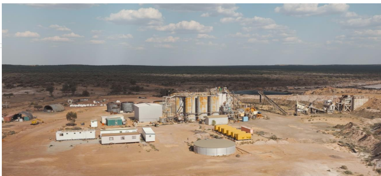
Brightstar Plant looking from the North-West

This report has valued the Brightstar Plant and associated infrastructure at $60.9 million on an "as new" replacement value basis.