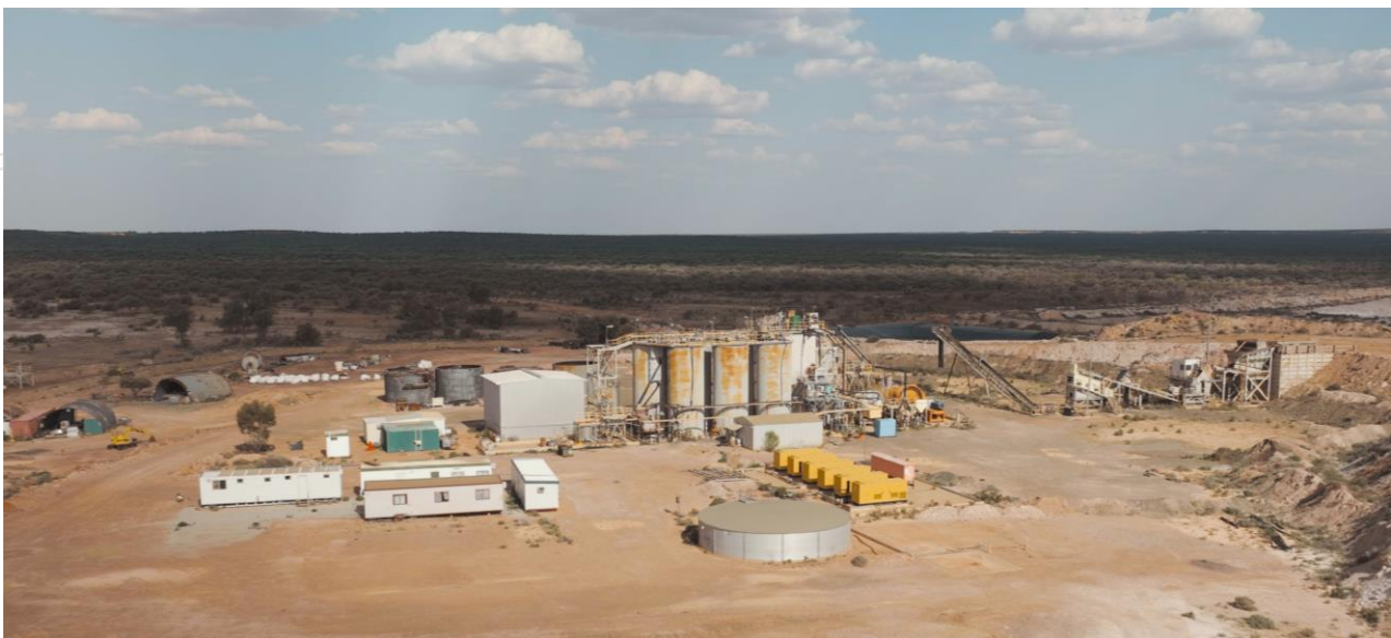
Brightstar Plant looking from the North-West

This report has valued the Brightstar Plant and associated infrastructure at $60.9 million on an "as new" replacement value basis.