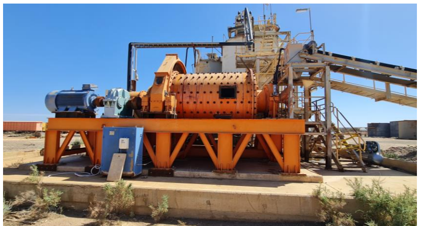
Left: Gravity Circuit. Right: 450kW Ball Mill