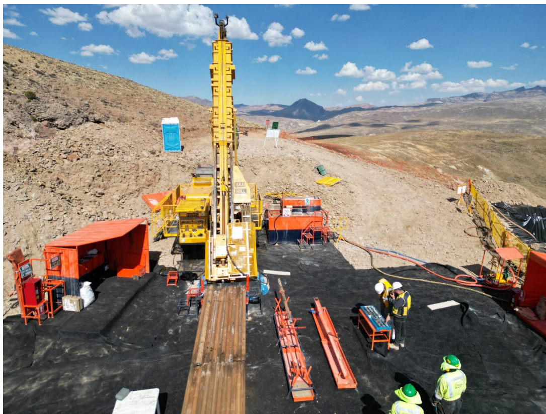
Figure 1: Drill rig on site at Cobremani target

"The team has generated a significant number of targets through the exploration work completed so far, and we look forward to bringing regular drilling updates to our shareholders and followers in the coming weeks."