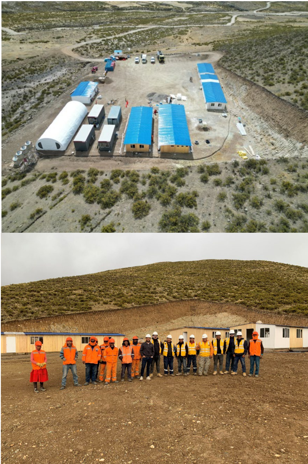
Figure 3: Picha exploration team and camp site