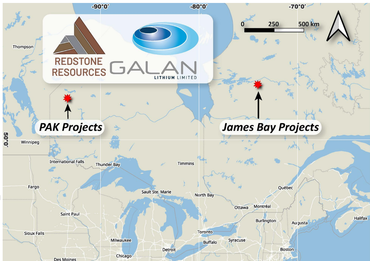
Figure 1 - Location of the joint JV Projects between Redstone Resources and Galan Lithium Limited. The PAK projects are located in Northwest Ontario, while the Taiga-Hellcat-Camaro projects are located in James Bay, Quebec, Canada

Securing a prospective position in two premier lithium exploration global hotspots is value accretive and complements our exploration efforts in Greenbushes South in Western Australia to create further value for shareholders in parallel with our development and production lithium brine assets in Argentina."