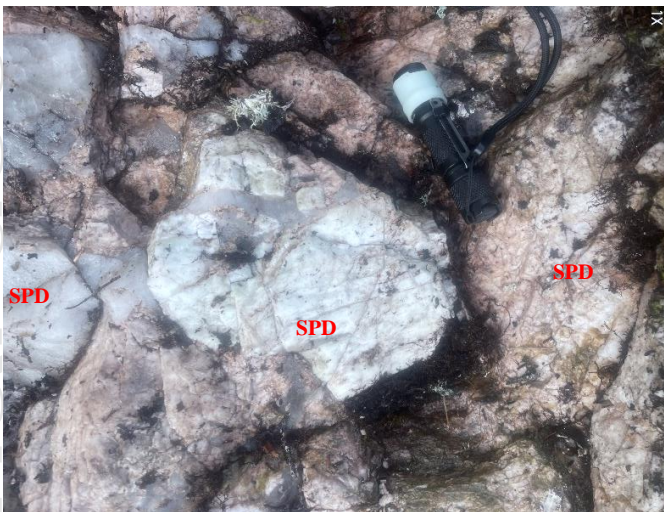
Figure 2 (top left): Photo of sample H909418 from Polaris. Photograph field of view contains 80% white to pinkish stained spodumene (SPD), 20% translucent quartz and feldspar. NB: UV light is 9cm for scale.

As a direct result of Cosmos's successful field strategy, and on closer follow-up inspection on one specific area, large white (to faint green) spodumene crystals up to 20cm were observed in a moss-covered outcrop or pegmatite over a small area (Figure 1, 2 & 3). Clearing moss off the pegmatite outcrop revealed an outcrop of at least 20m by 10m with further sporadic clearing along strike confirming that the same pegmatite extends for at least 40m by 20m (Figure 1). Due to the dominantly white colour of spodumene and the black moss staining of the outcrop, spodumene percentages were difficult to determine but they were positively identified in at least two areas.