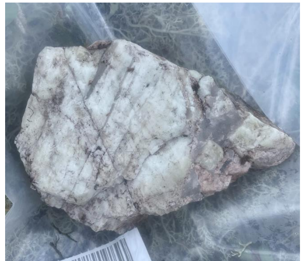
Figure 3 (top right): Close-up photograph of one large 20cm long spodumene crystal from sample H909418.

An important field observation of the outcrop at Polaris is that the pegmatite appears to plunge under low-lying cover and swamp along strike to the south-southwest. The Polaris spodumene-bearing outcrop is interpreted to remain open in this direction and concealed beneath cover. In light of this exciting breakthrough, further work is warranted to evaluate the potential to delineate drill targets for the upcoming winter drilling season.