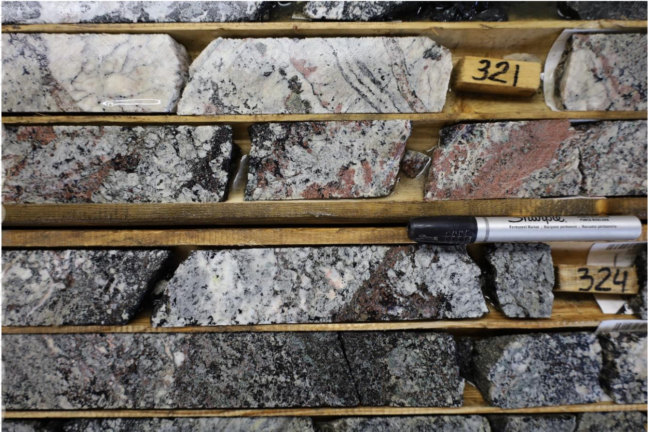
Figure 3: Cut and sampled diamond drill core from hole POM-23-03 showing visible REE mineralisation (red colour) hosted by ferrocarbonatite. Approximately 321 – 325m downhole.

A number of higher-grade intersections greater than 1% TREO were reported within the broad mineralised zone, with the best including 8.5m @ 1.62% TREO and 0.03% Nb 2 O 5 from 254m downhole; and 26.5m @ 1.45 TREO and 0.02% Nb 2 O 5 from 321m downhole. Full details of the relevant intersections are detailed in Appendix II.