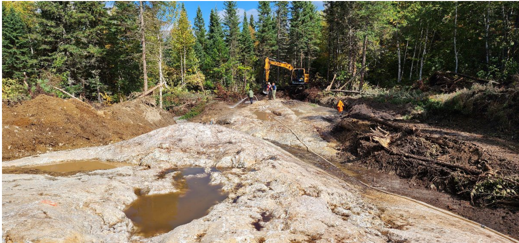
Figure 5 – Mechanical stripping underway at Nelson occurrence

"It's very satisfying to have our maiden drilling campaign underway at the Gorge Lithium Project. We know from channel sampling that the Koshman and Nelson pegmatite outcrops are lithium bearing and we are extremely excited to learn more about the project's geology from current drilling.