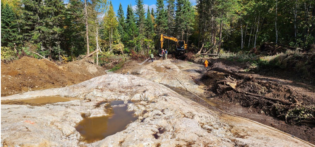
Figure 5 – Mechanical stripping underway at Nelson occurrence

"It's very satisfying to have our maiden drilling campaign underway at the Gorge Lithium Project. We know from channel sampling that the Koshman and Nelson pegmatite outcrops are lithium bearing and we are extremely excited to learn more about the project's geology from current drilling.