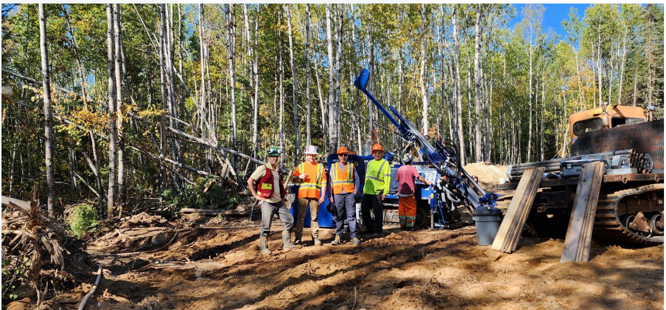
Figure 1 – BMM's General Manager of Exploration with drilling crew in front of drill hole NL-23-001

The ongoing drilling program will be the first sub-surface testing for lithium mineralisation at the Gorge Lithium Project where previous channel sampling results confirmed high grade lithium mineralisation at the surface, including 1.8m @ 3.75% Li 2 O. (see ASX Announcement dated 16 December 2022).