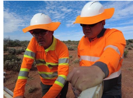
Figure 2: Drilling at the Merino prospect.

Kennedy drilling has demobilised from the Merino site.