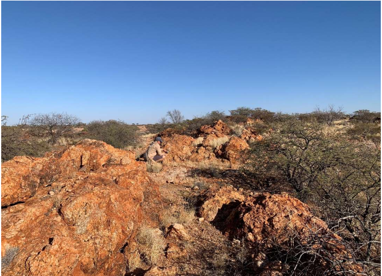
Figure 2: Peggy Sue Prospect showing coarsely crystalline pegmatite intruding mafic sediments of the Leake Springs Metamorphics Group.

Reach Resources Limited (ASX: RR1 & RR10) (“ Reach ” or “the Company ”) is pleased to advise that recent mapping at the Company’s 100% owned Morrissey Hill Lithium Project, Yinnetharra WA has identified multiple, previously unrecognised, wide and strike extensive pegmatite swarms.