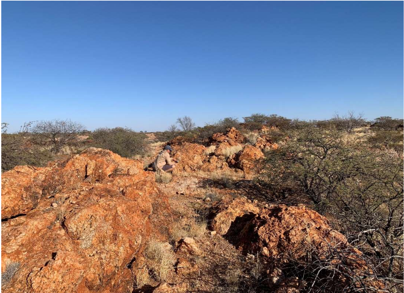
Figure 2: Peggy Sue Prospect showing coarsely crystalline pegmatite intruding mafic sediments of the Leake Springs Metamorphics Group.

Reach Resources Limited (ASX: RR1 & RR10) (" Reach " or " the Company ") is pleased to advise that recent mapping at the Company's 100% owned Morrissey Hill Lithium Project, Yinnetharra WA has identified multiple, previously unrecognised, wide and strike extensive pegmatite swarms.