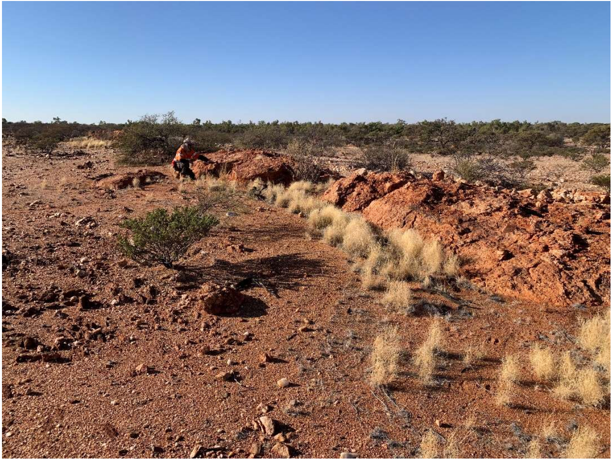
Figure 6: Sunset Boulevard coarsely crystalline outcropping pegmatite hosted in mafic sediments of the Leake Springs Metamorphics.

This announcement has been authorised by the Board of Reach Resources Limited