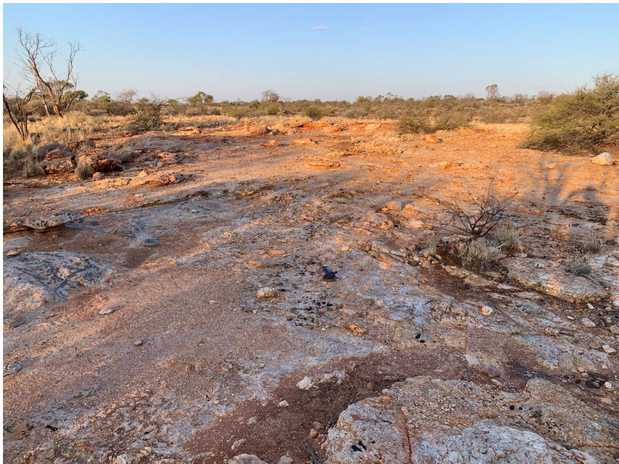
Figure 4: Martin's Reach Prospect – 30m wide pegmatite pavement.

Our new target areas are a significant development as they potentially extend our strike length at Morrissey Hill to over 10km across all the target areas. This 10km does not include the "blind" pegmatites that we know are on site, based on our intersections during the maiden drill campaign. The Future is within Reach."