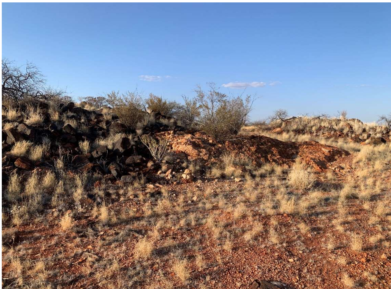
Figure 3: Martin's Reach Prospect showing pegmatite intruding mafic volcanics (basalt/greenstones).

Results from this work together with those from the recently completed maiden drilling program at the Bonzer Prospect will determine the order, extent and locations for future drill programs.