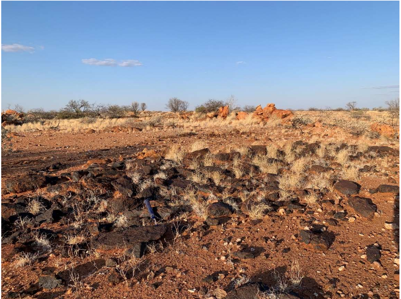
Figure 5: Martin's Reach Prospect - Pegmatites are hosted or intrude into the greenstone or mafic package.