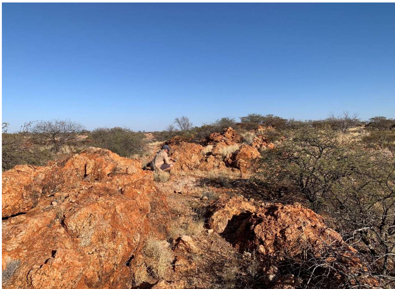
Figure 2: Peggy Sue Prospect showing coarsely crystalline pegmatite intruding mafic sediments of the Leake Springs Metamorphics Group.

Reach Resources Limited (ASX: RR1 & RR10) (" Reach " or " the Company ") is pleased to advise that recent mapping at the Company's 100% owned Morrissey Hill Lithium Project, Yinnetharra WA has identified multiple, previously unrecognised, wide and strike extensive pegmatite swarms.