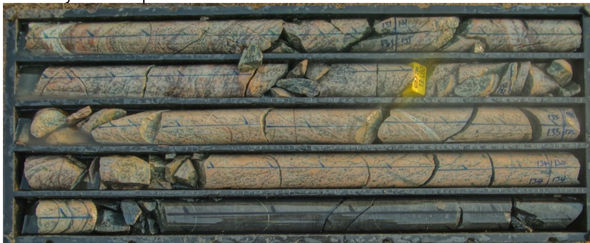
Figure 2. Diamond drill core from hole MDD 005 containing potential REE mineralisation from visual inspection (pinkish coral colour) from approximately 130m to 135m down hole

visually estimate the percentage of REE mineralisation, and this will be determined by laboratory results reported in full once received.