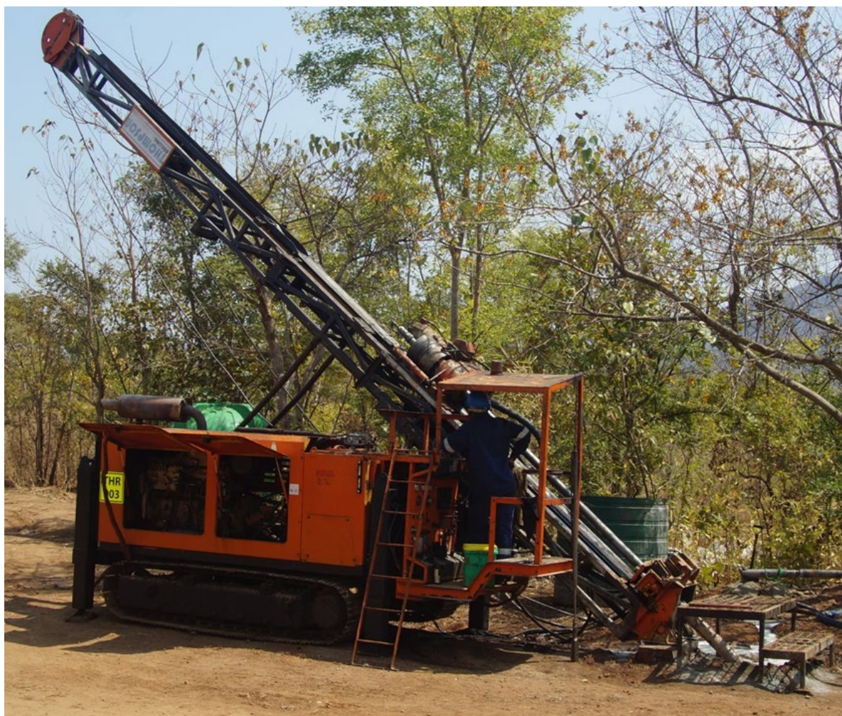
Figure 1. Diamond Drilling at Machinga North Prospect (MDD 005)

commencement of mineralogical work to identify the REE-controlling phases and their distribution.