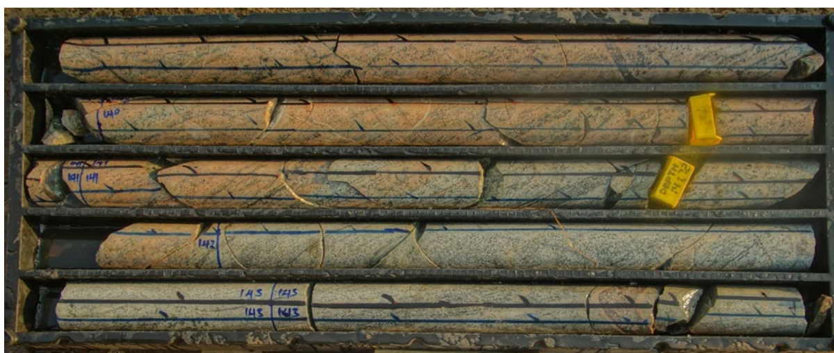
Figure 3. Diamond drill core from hole MDD 005 containing potential REE mineralisation from visual inspection (pinkish coral colour) from approximately 139m to 143m down hole