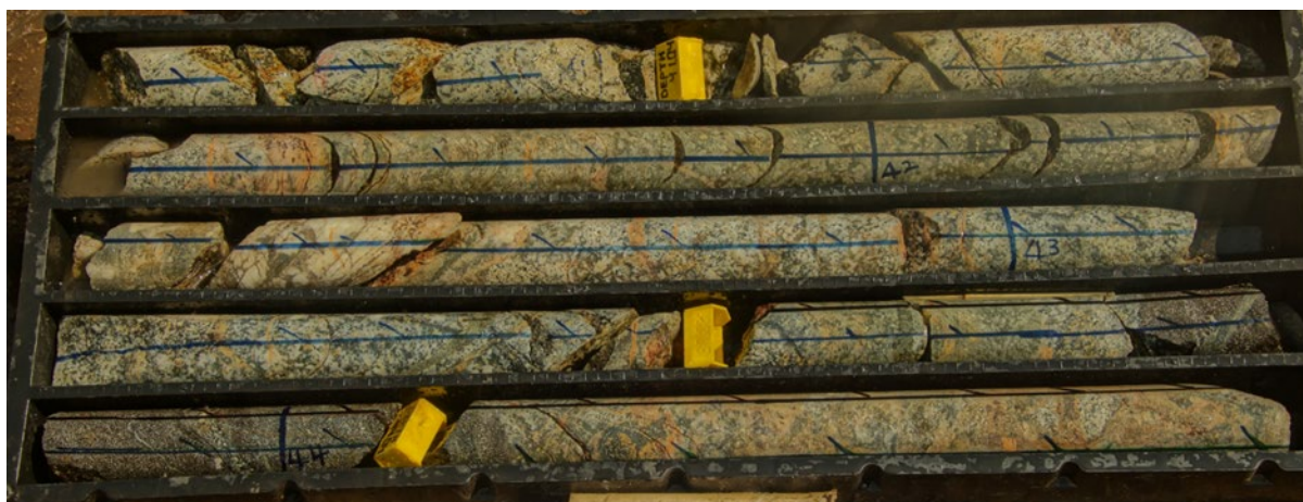
Figure 4. Diamond drill core from hole MDD 006 (metallurgical DD hole) containing potential REE mineralisation from visual inspection (pinkish coral colour) from approximately 41m to 45m down hole