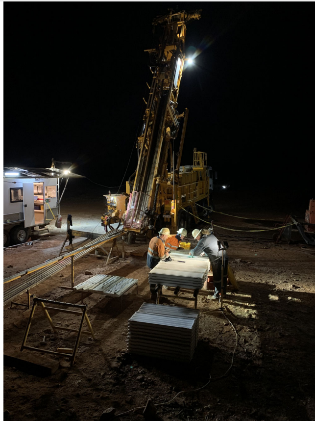
Figure 1: Late night diamond drilling at the Bonzer Prospect, Morrissey Hill Lithium Project. Diamond Drillhole 23MHD03