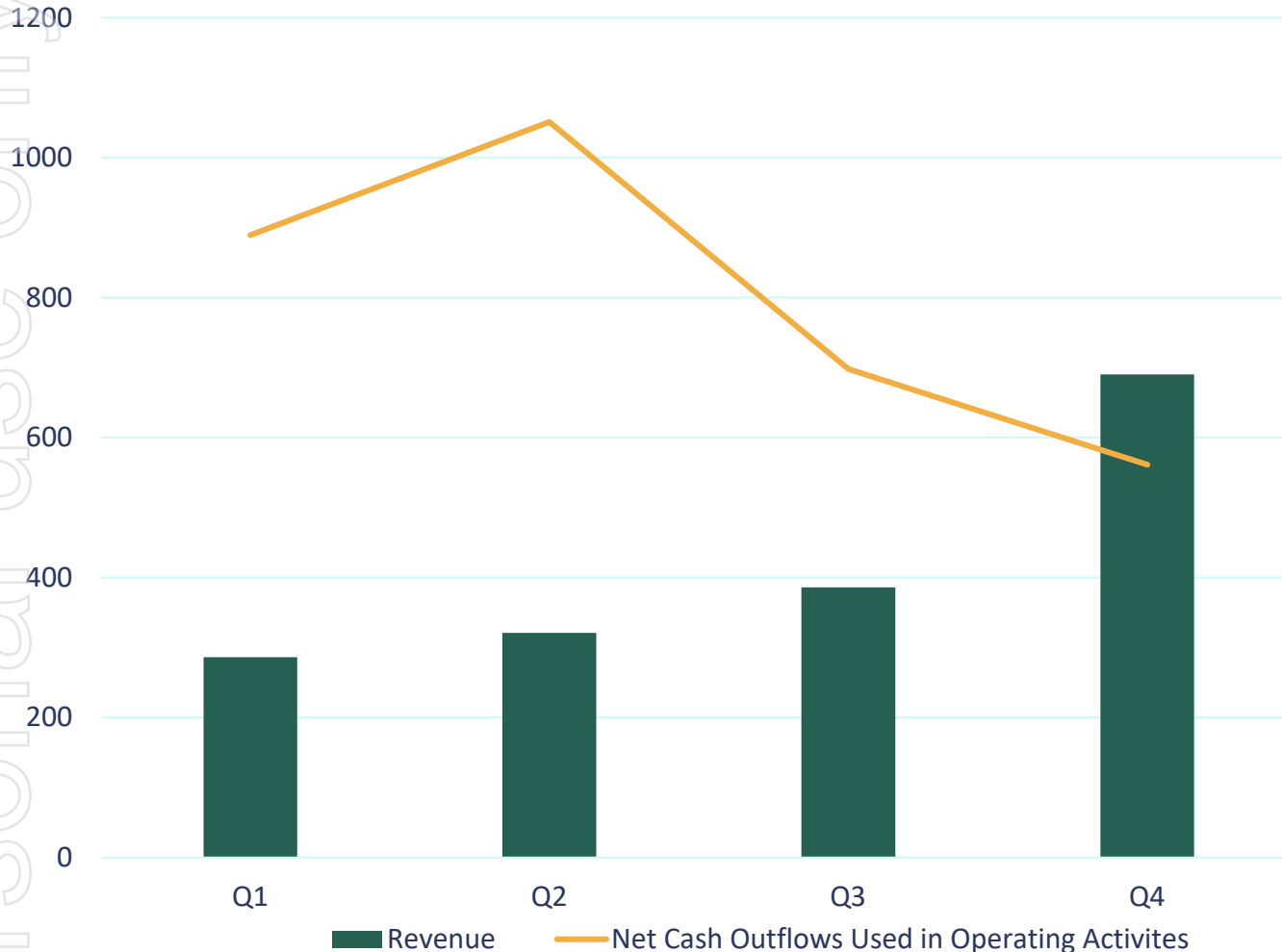
Quarterly Revenues & Net Cash Outflows Used in Operations

79% increase in sales revenue in Q4 (vs Q3, 2023) largely due to strong sales growth in ecommerce sales in the USA and new distribution partners.