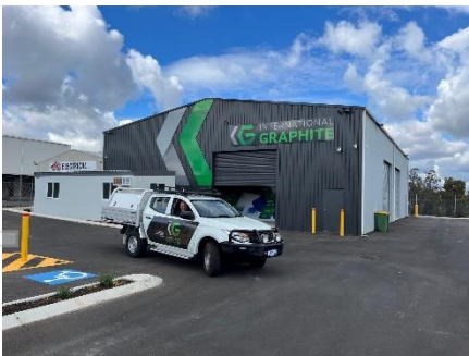
Fig 1 Collie R&D facility

International Graphite Limited (ASX: IG6) has received works approval from the Western Australian Government to install new graphite micronising equipment at the Company's downstream research and development facility in Collie, Western Australia.