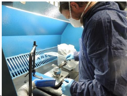
Fig 2 Micronising pilot samples