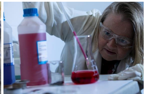
Fig 3 Testwork at Collie

The equipment is currently in transit from North America and is expected to arrive at Fremantle Port next month (September 2023).