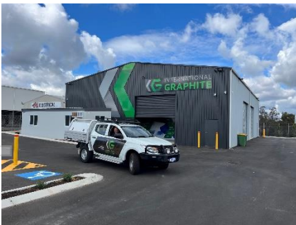
Fig 1 Collie R&D facility

International Graphite Limited (ASX: IG6) has received works approval from the Western Australian Government to install new graphite micronising equipment at the Company's downstream research and development facility in Collie, Western Australia.