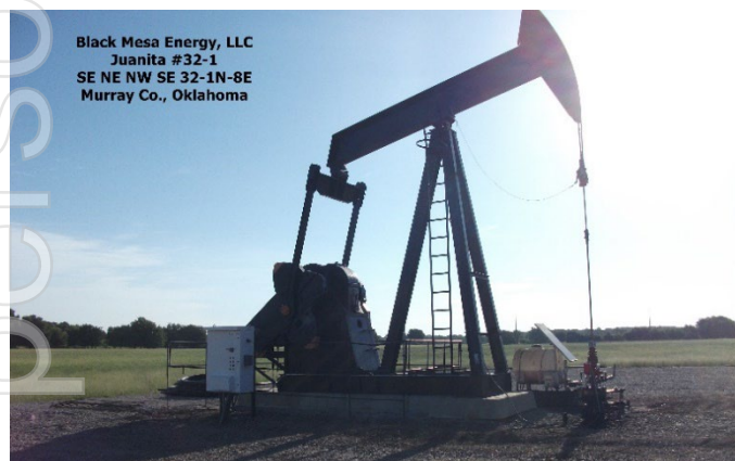
Figure 1: Pumping unit operating on the Juanita Well

The Juanita Well has been brought on production (Figures 1 and 2) after successful completion and comingling of two separate sands in the highly productive Simpson Group. Production has averaged 112 BOPD over the last 5-days (versus an initial peak rate of 130 BOPD) as the well cleans up. Fluid movement is being managed by the size of the pumping unit to ensure optimum reservoir performance and maximum recovery as we learn more about the capability of these two zones.