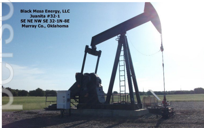
Figure 1: Pumping unit operating on the Juanita Well

The Juanita Well has been brought on production (Figures 1 and 2) after successful completion and comingling of two separate sands in the highly productive Simpson Group. Production has averaged 112 BOPD over the last 5-days (versus an initial peak rate of 130 BOPD) as the well cleans up. Fluid movement is being managed by the size of the pumping unit to ensure optimum reservoir performance and maximum recovery as we learn more about the capability of these two zones.