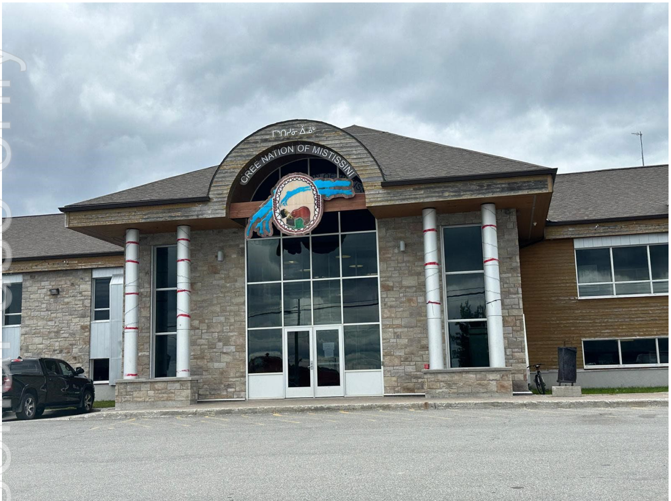
Figure 5 – Cree Nations office – Mistissini, Quebec