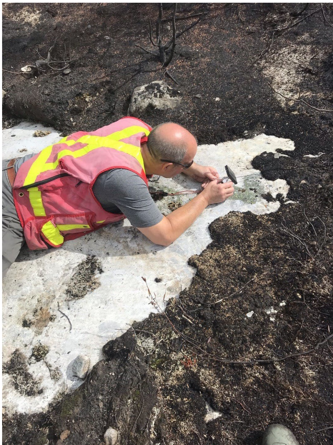
Figure 3 – Winsome Resources' VP of Exploration, taking measurements on a pegmatite outcrop at our flagship project, Adina, in Quebec, Canada