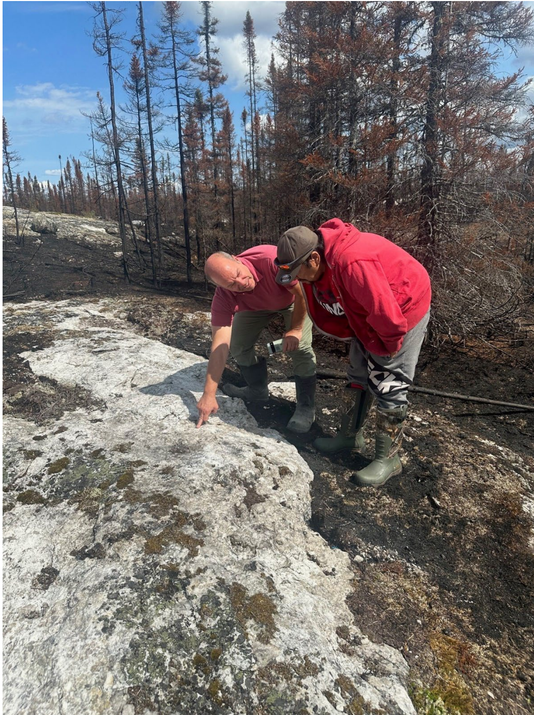
Figure 2 – Winsome Resources' VP of Exploration, along with tallyman from Cree community Mistissini, closely examining an exposed pegmatite dyke at our flagship project, Adina, in Quebec, Canada