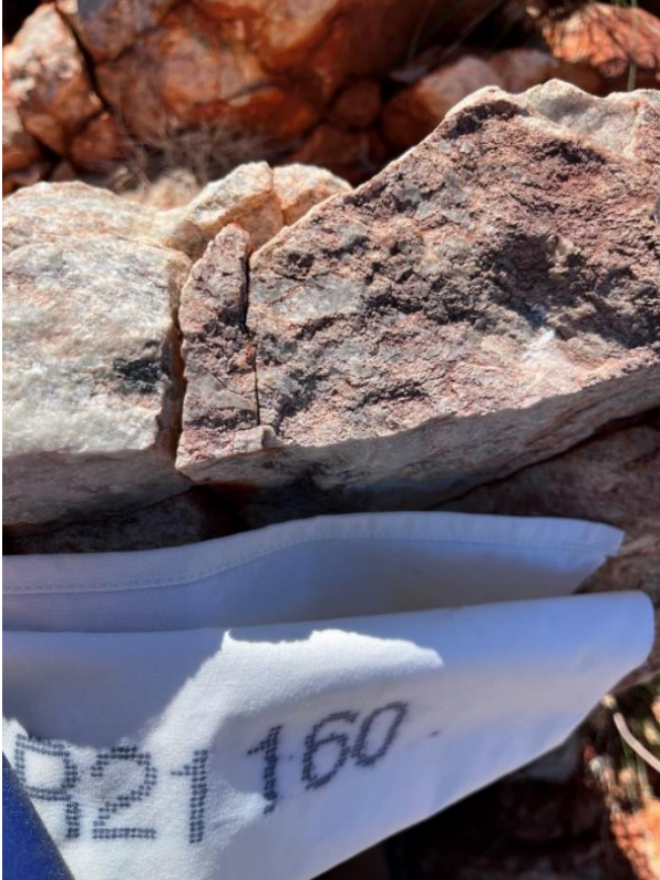
Figure 2: Rock sample R21160, collected from a 6-metre wide, 200m long pegmatite outcrop