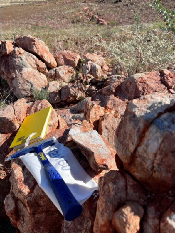
Figure 3: Pegmatite outcrop at rock sample R21160 location, with further pegmatite outcrops along strike (in background)