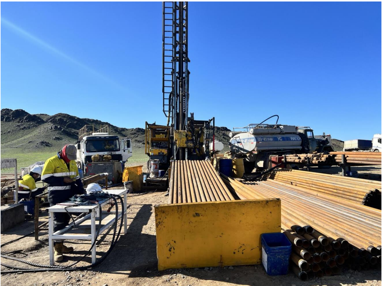
Erdene drilling rig at Big Slope 7

The well was drilled by Mongolian drilling contractor Erdene Drilling LLC and is the first of a number of wells it is contracted to Elixir for drilling in the region. The rig has now moved to a nearby location to the West of the previous well to drill a corehole: Big Slope Shallow-1, where it will appraise the shallower coals at deeper locations.