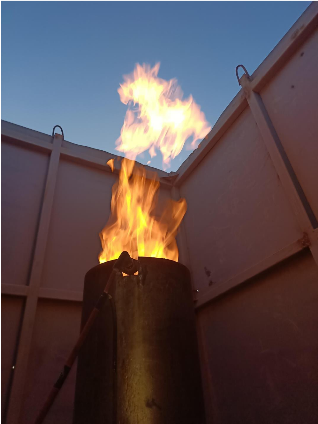
Recent flare at the Nomgon Pilot

The Big Slope-7 appraisal corehole has now been completed. The well was drilled to a depth of 666 metres, with drilling curtailed slightly ahead of the originally planned total depth due to difficult hole conditions. A total of 35 metres of coal and 7m of silty coal was intersected, with 1 Drill Stem Test (DST) conducted. The interpretation of the results of the DST will be announced in due course.