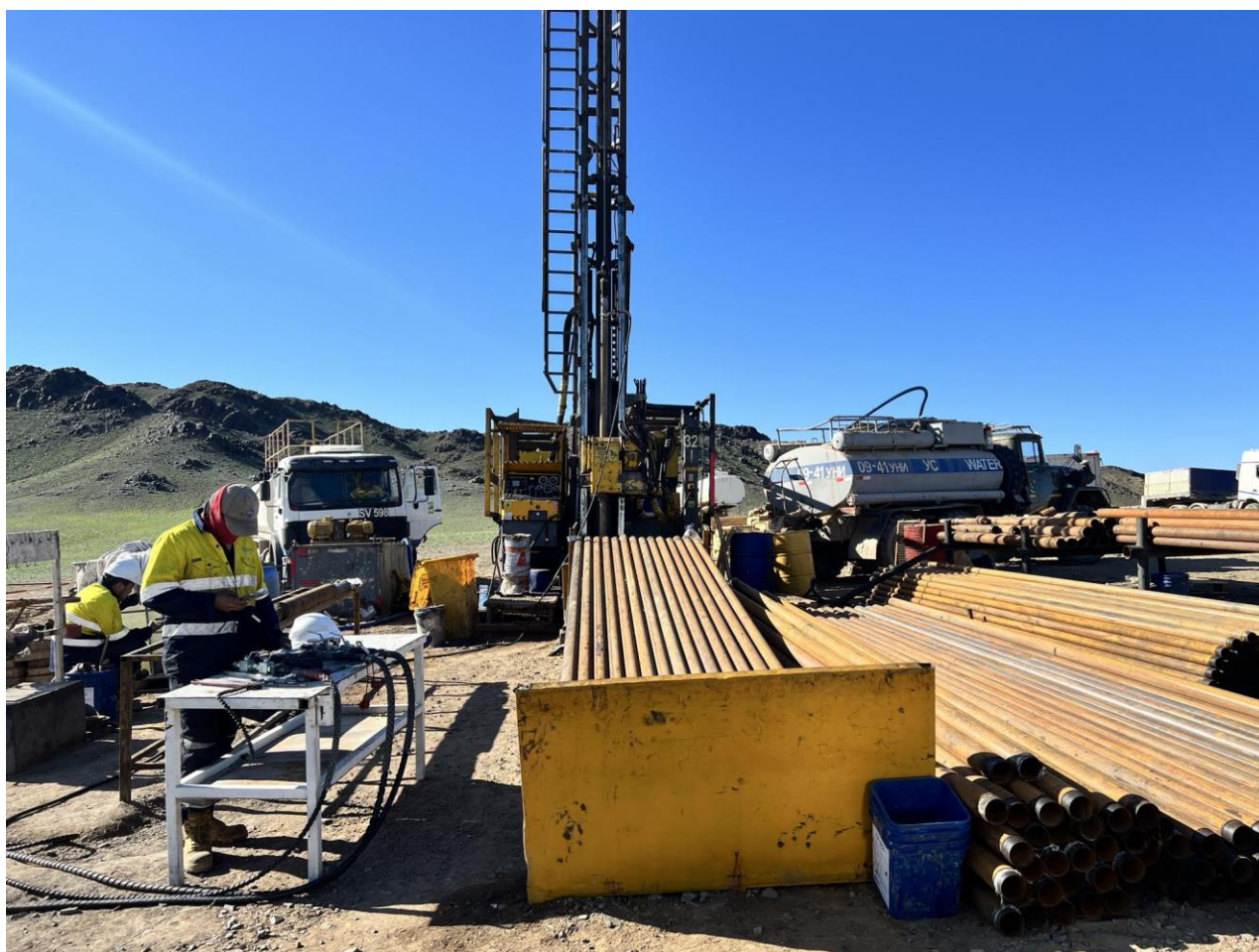
Erdene drilling rig at Big Slope 7

The well was drilled by Mongolian drilling contractor Erdene Drilling LLC and is the first of a number of wells it is contracted to Elixir for drilling in the region. The rig has now moved to a nearby location to the West of the previous well to drill a corehole: Big Slope Shallow-1, where it will appraise the shallower coals at deeper locations.