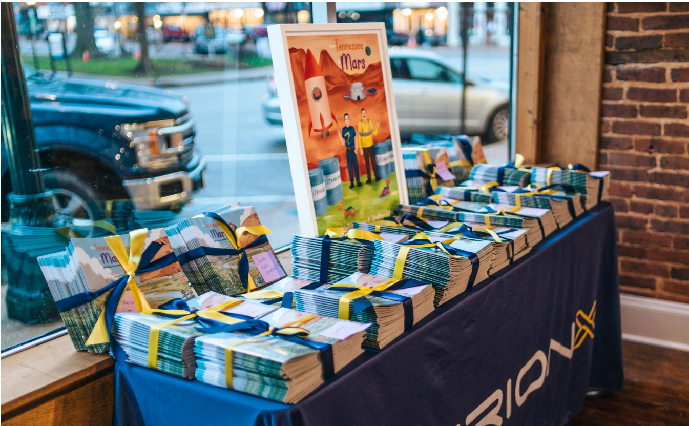
Figure 5: IperionX children's book launch.