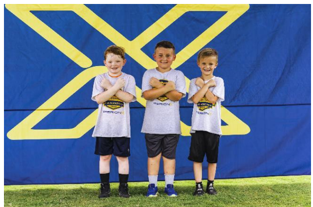
Figure 1: IperionX activities in the west Tennessee community.