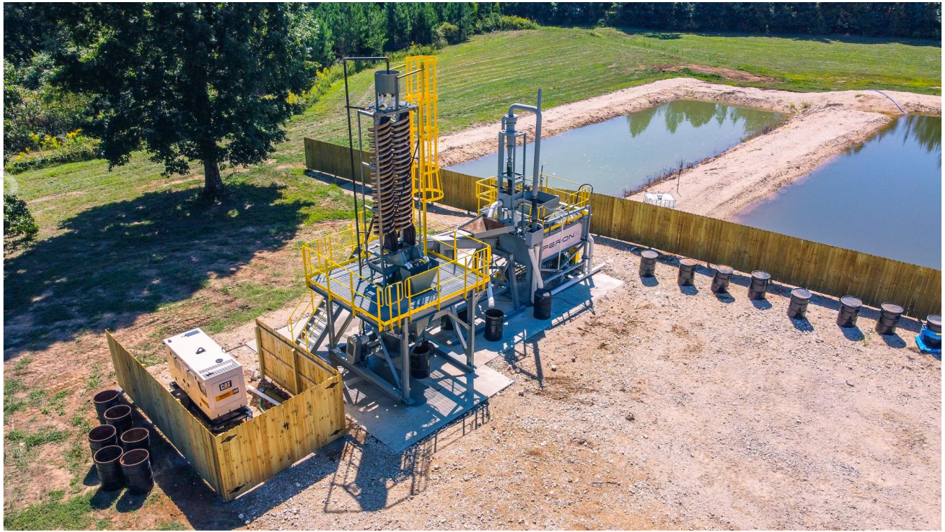
Figure 2: IperionX's permitted Titan Project, including existing Mineral Demonstration Facility operations, west Tennessee.