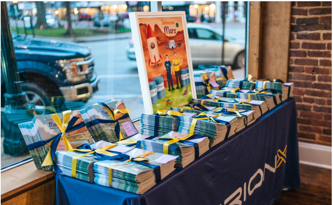
Figure 5: IperionX children's book launch.