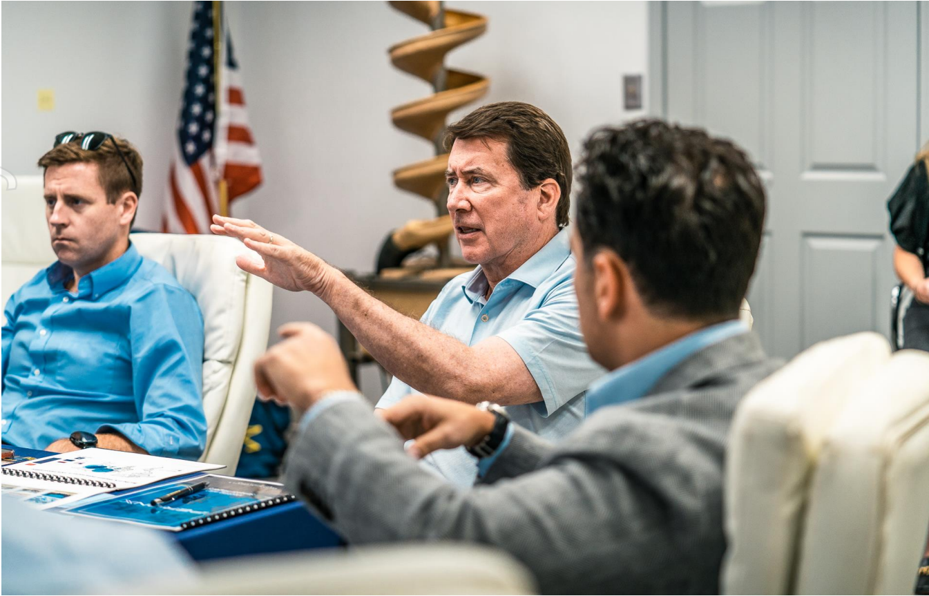
Figure 4: Senator Bill Hagerty visiting the IperionX project office, west Tennessee.