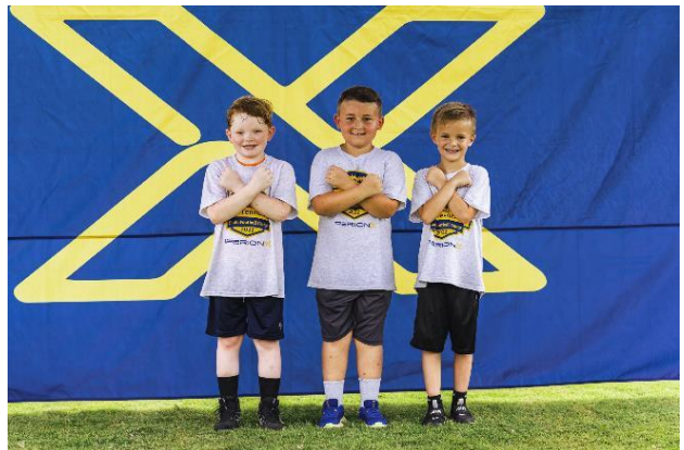
Figure 1: IperionX activities in the west Tennessee community.