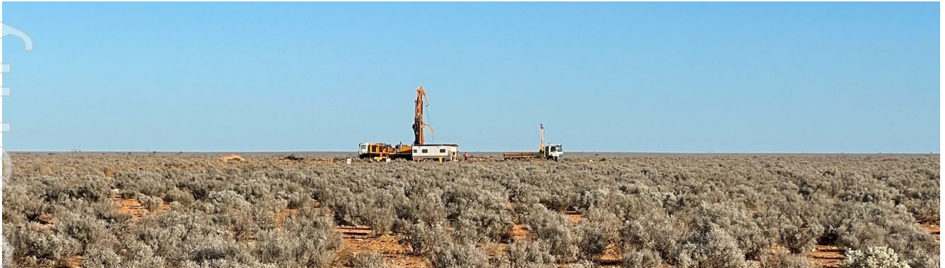
Figure 1: SensOre deployed technology on client and joint-venture projects across Australia in the June Quarter

SensOre (ASX:S3N) is pleased to present its quarterly activities report for the period ending June 2023.