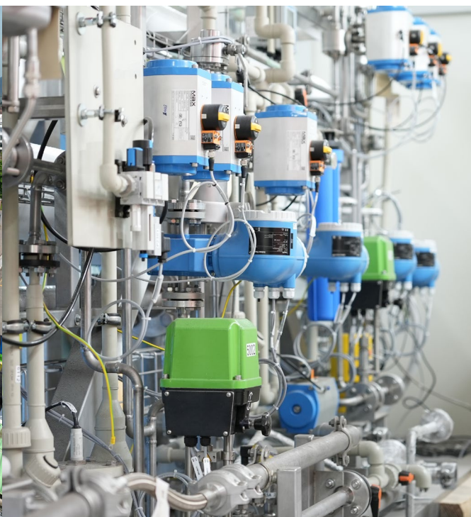
Figure 2 Electrical installation LEOP, Landau