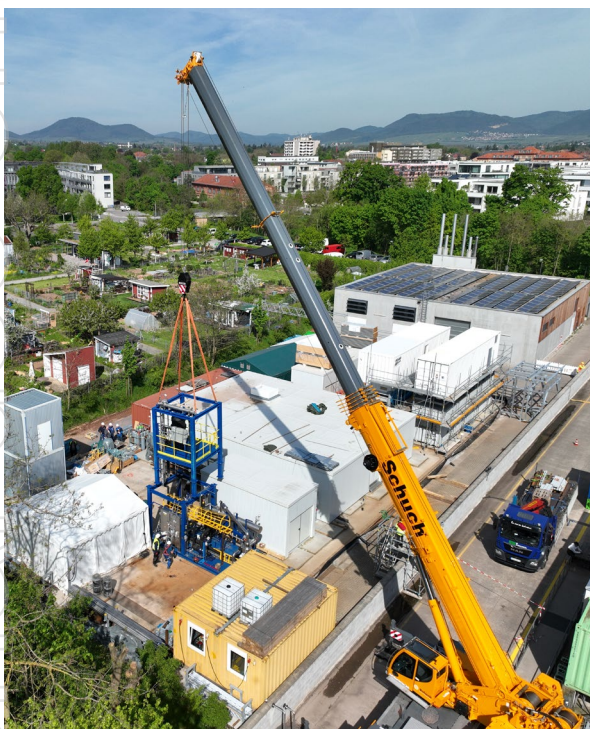
Figure 1 Installation of Crystallizer at LEOP, Landau

birth of the first domestically produced lithium chemicals industry in Europe, for the battery electric vehicle industry.