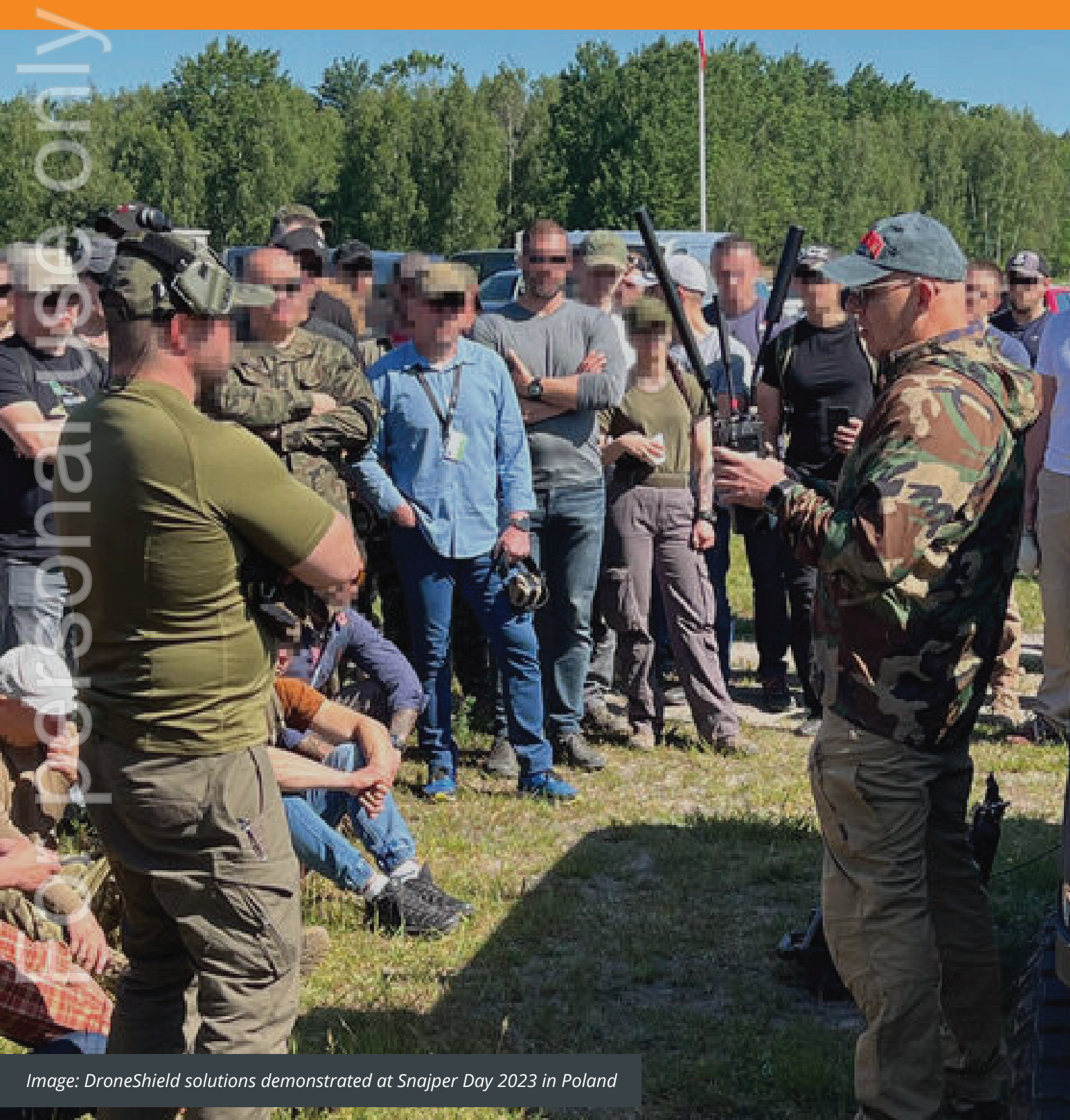
Image: DroneShield solutions demonstrated at Snajper Day 2023 in Poland