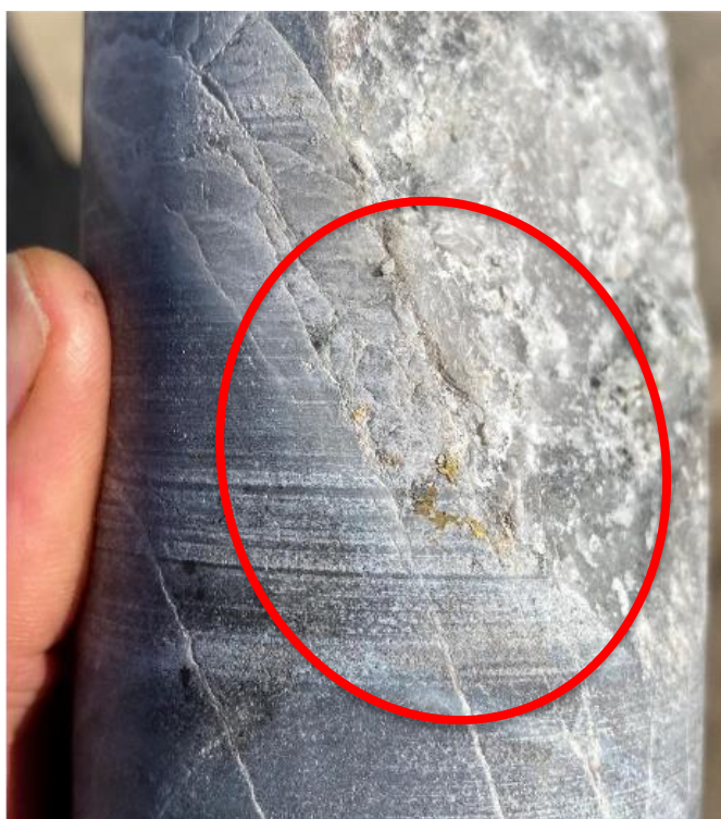
Figure 1. Visible gold at RPM – Hole RPM-043

Nova Minerals Limited (Nova or the Company) (ASX: NVA, OTC: NVAAF, FSE: QM3) is pleased to again announce visible gold at the high grade RPM Deposit, within the Company's flagship Estelle Gold Project, located in the prolific Tintina Gold Belt in Alaska.