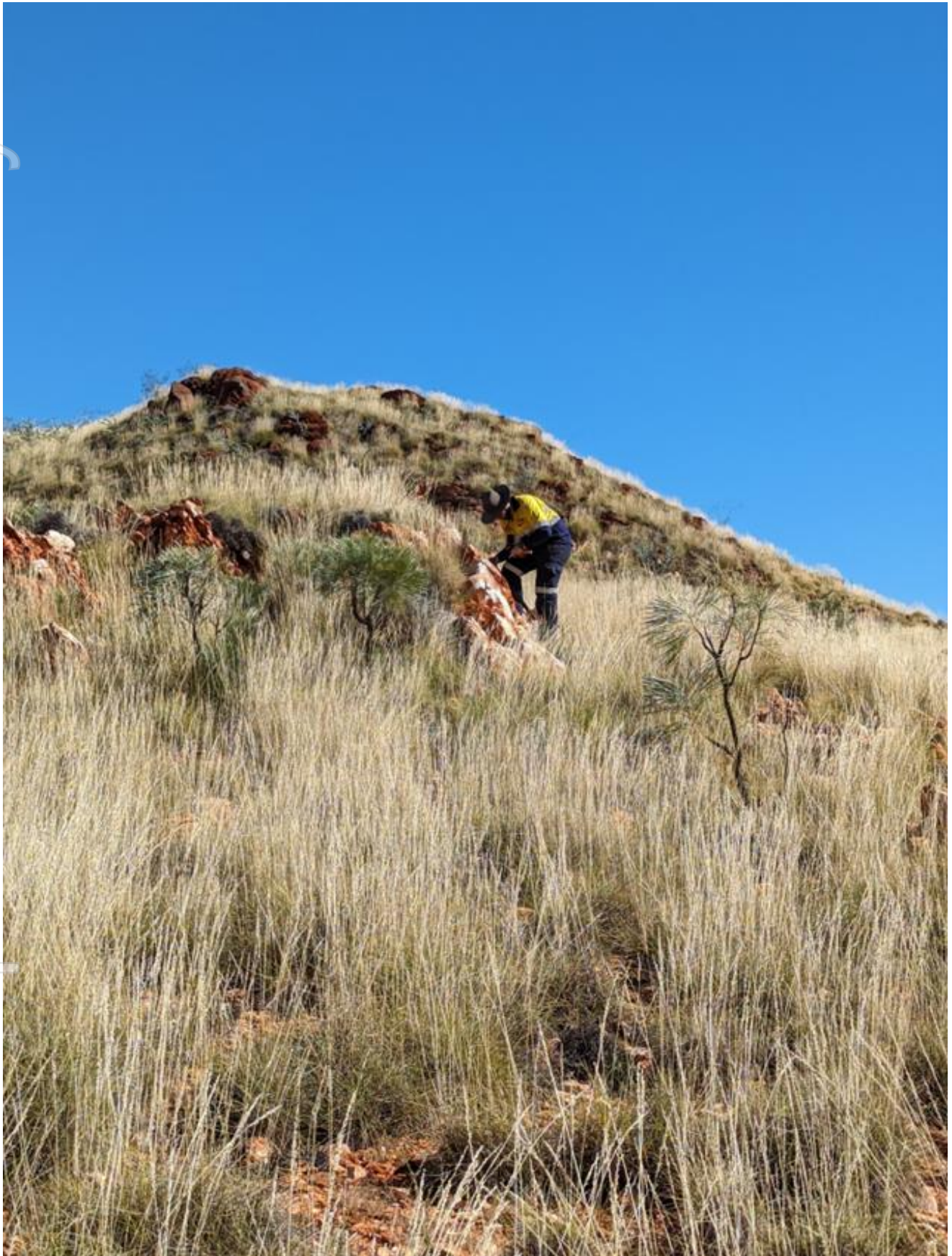
Figure 3. Sampling Pegmatite Outcrop at Rock Sample Site 23CR038