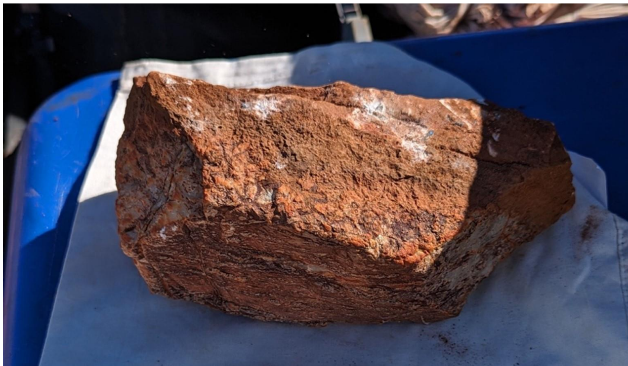
Figure 1. Rock Sample 23CR038 (Refer to Assay Table for Lithium Analysis)

Using the information gained from the discovery of the two lithium pegmatite trends, the Company is reviewing historic datasets with a view to potentially identifying new lithium pegmatite trends, and extensions to the known trends, within the broader Ruth Well and Osborne Project areas.